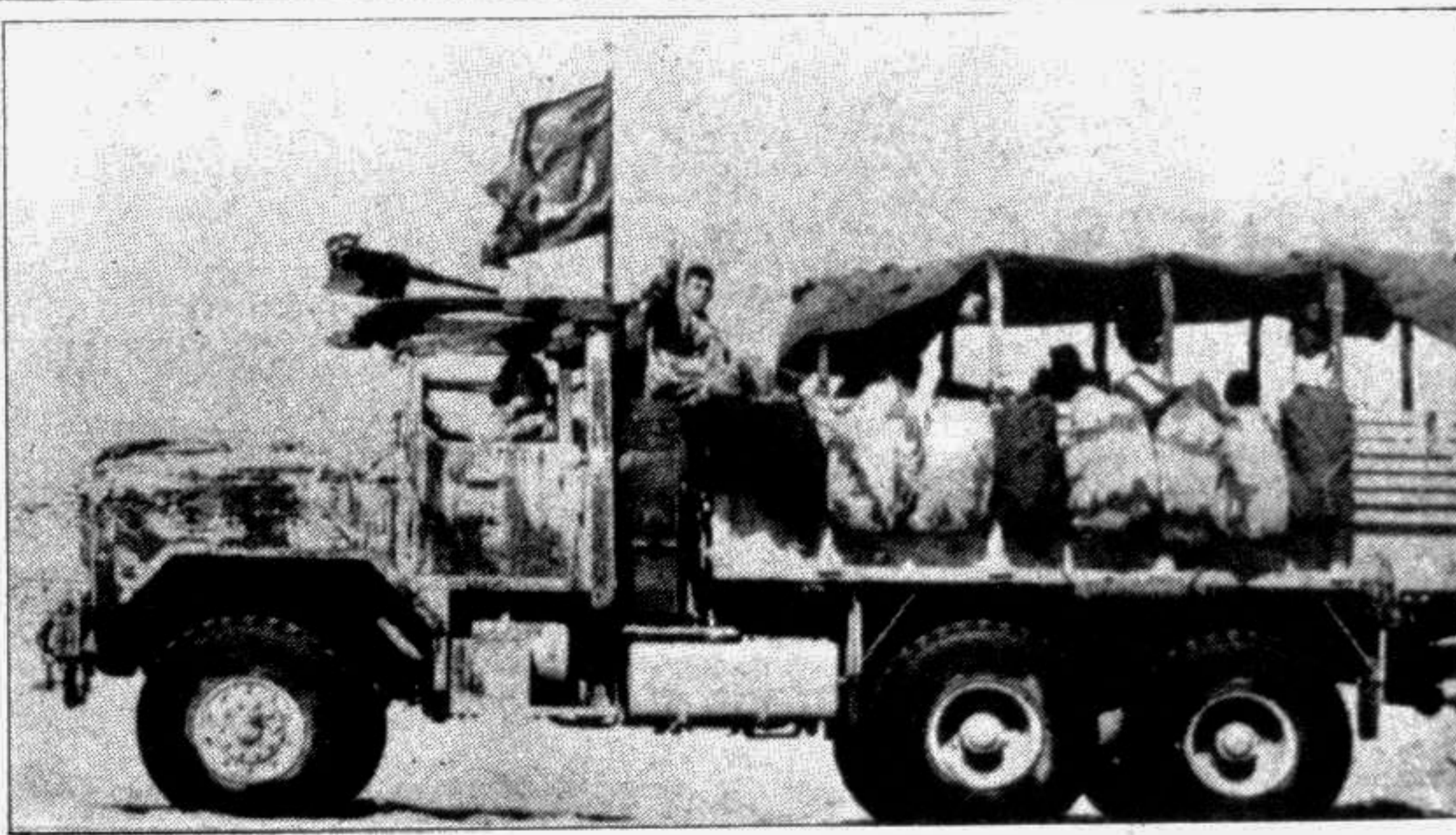
A U.S. Marine truck carries troops near the Kuwaiti border in S. Arabia

MEXICO CITY, Feb 4: UN mediated peace talks between leftist Salvadorean rebels and the Government ended on Sunday and a rebel source said a deadlock of many months had been broken, reports Reuter.