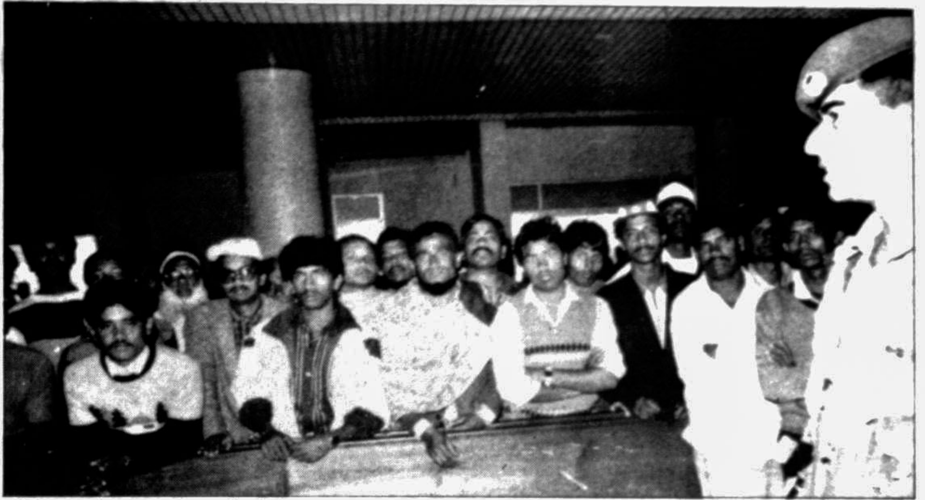
Anxious relatives waiting at Zia International Airport for arrival of 75 Bangladeshis from Amman on Monday. (Arrival story on page 1)