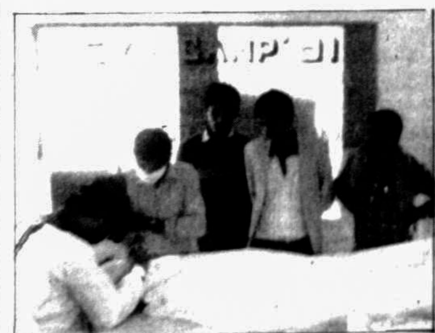
NETRAKONA: An eye patient is being operated upon at an eye camp recently.