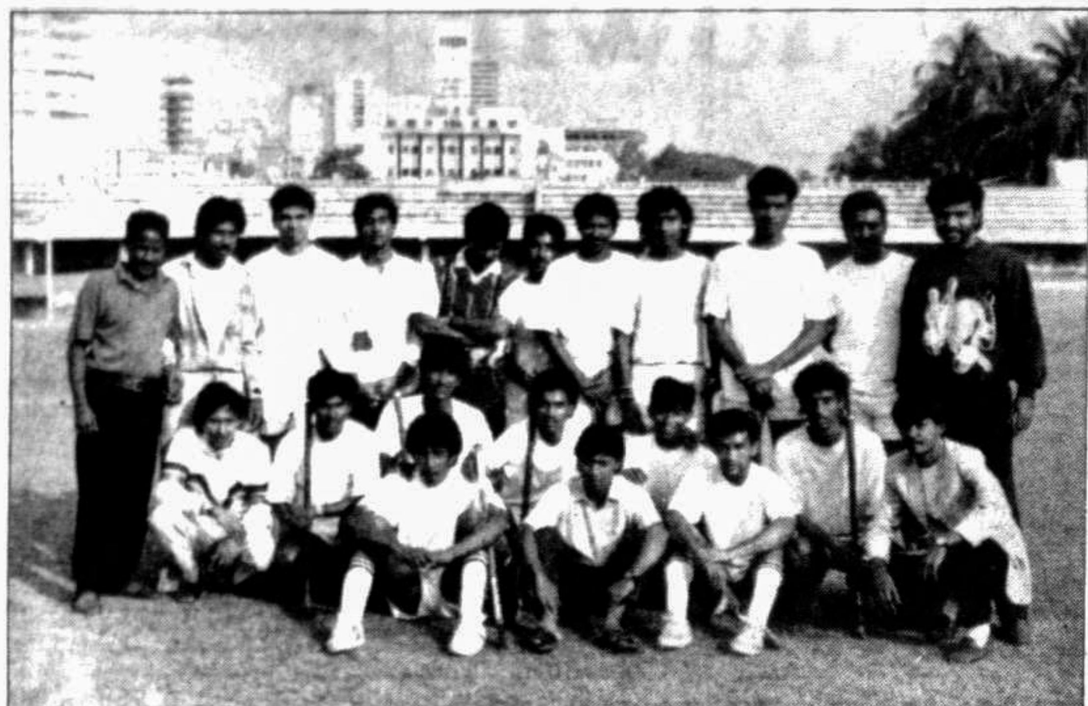
Bangladesh Sporting Club became the Delta Life Second Division hockey league champions following their 3-0 win over Barnak Samaj in yesterday's super league encounter at the hockey stadium.