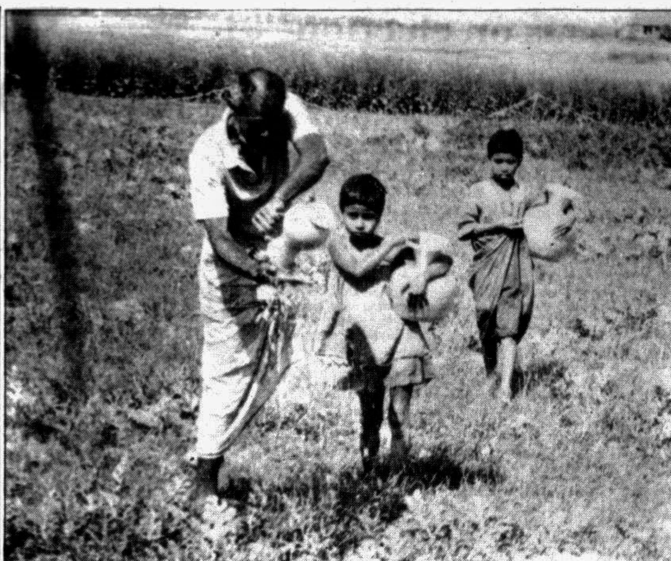
MUNSHIGANJ: Summer is nearing. Farmers have started cultivating different kinds of summer fruits. Here a farmer is watering his watermelon field while his children are ready for his help.