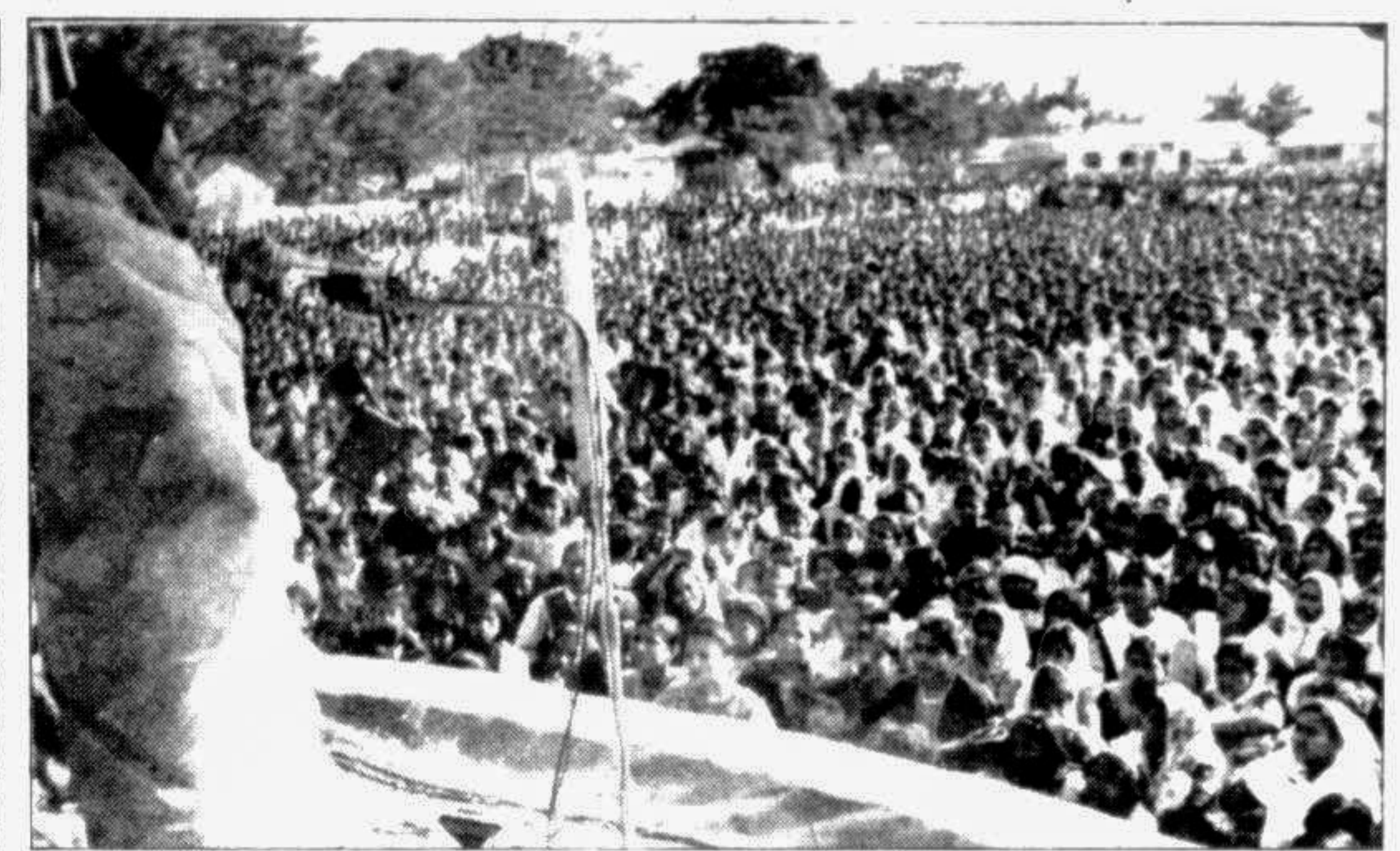
BNP Chairperson Begum Khaleida Zia addressing a big public meeting at Chatai in Tangail yesterday.

The disgruntled leaders of the Awami League said that the last ditch effort to salvage the Eight-party Alliance by surrendering 36 seats had become a boomerang to the Awami League when the decision had failed to unite eight party leaders. Meanwhile the smaller components of the Eight-party Alliance who wanted to sit with Sheikh Hasina last night failed to get her audience. The Five-party Alliance in the newly formed Gonatantrik Otkyo Jote (GOJ), which took a stand to ignore the seat offer by the Awami League has not yet received any time schedule to discuss the future course of the GOJ. According to the Election Commission, there is no time to change the symbol now. If any one wants to challenge the symbol of any candidate he should file case in the court for judgment.