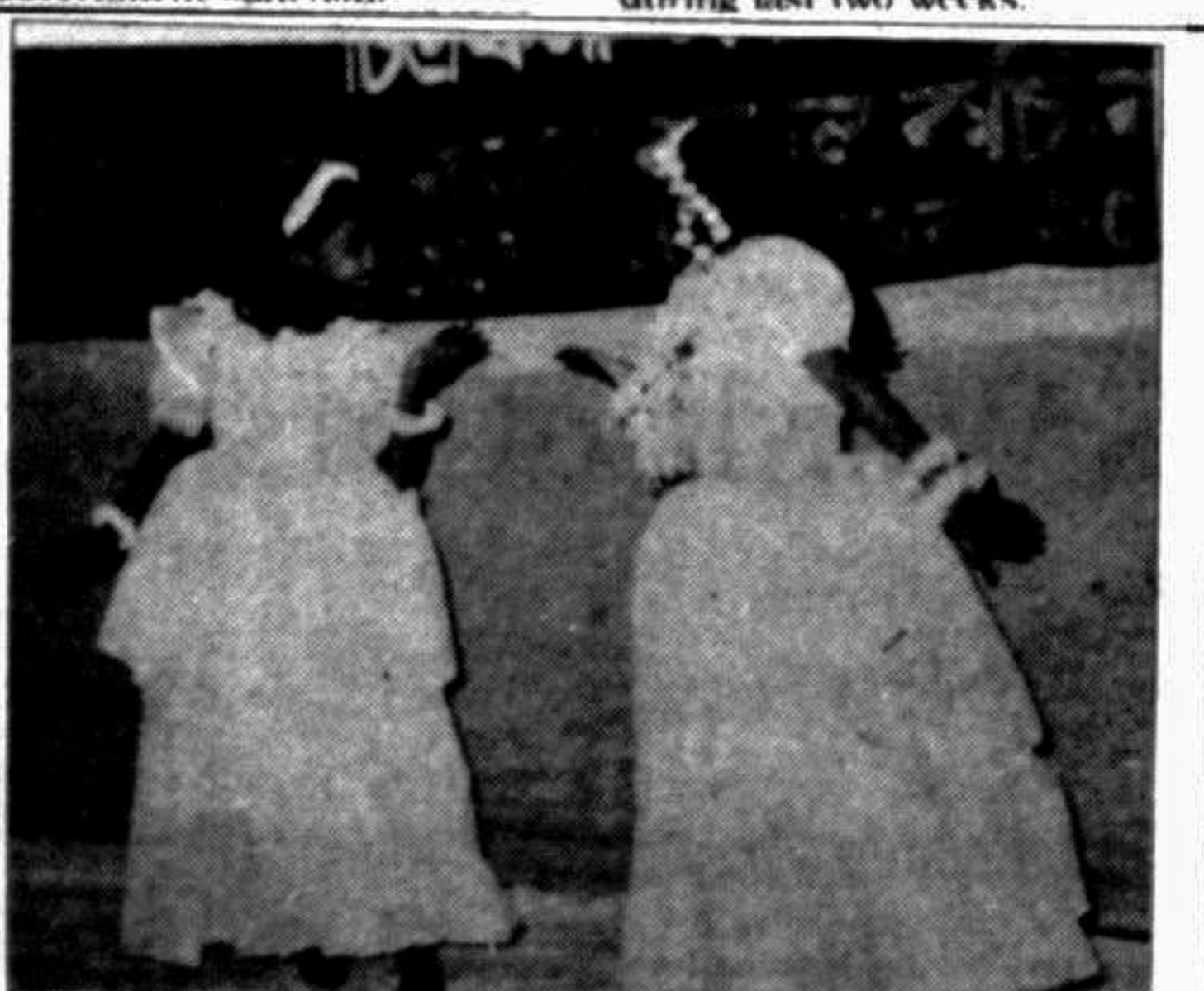
COX'S BAZAR: A scene from a cultural function held at Zila Parishad auditorium under the auspices of K-andri. Kachi Kanehar Mela recently.

Non-availability of TSP fertilizer has been persisting throughout Kushtia district causing threat to production of Rabi crop in this season. Crisis has resulted in a record rise of prices of the same in all the six upazilas of the district during last two weeks.