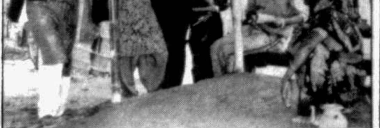
A group of journalists now participating in a workshop at the Press Institute on 'child care' visited a village in Narasingdi to see for themselves the child care and immunization project there. They are talking to a mother about child care and other aspects.

The price of iron rods for construction also marked a rise of Taka one thousand per ton.