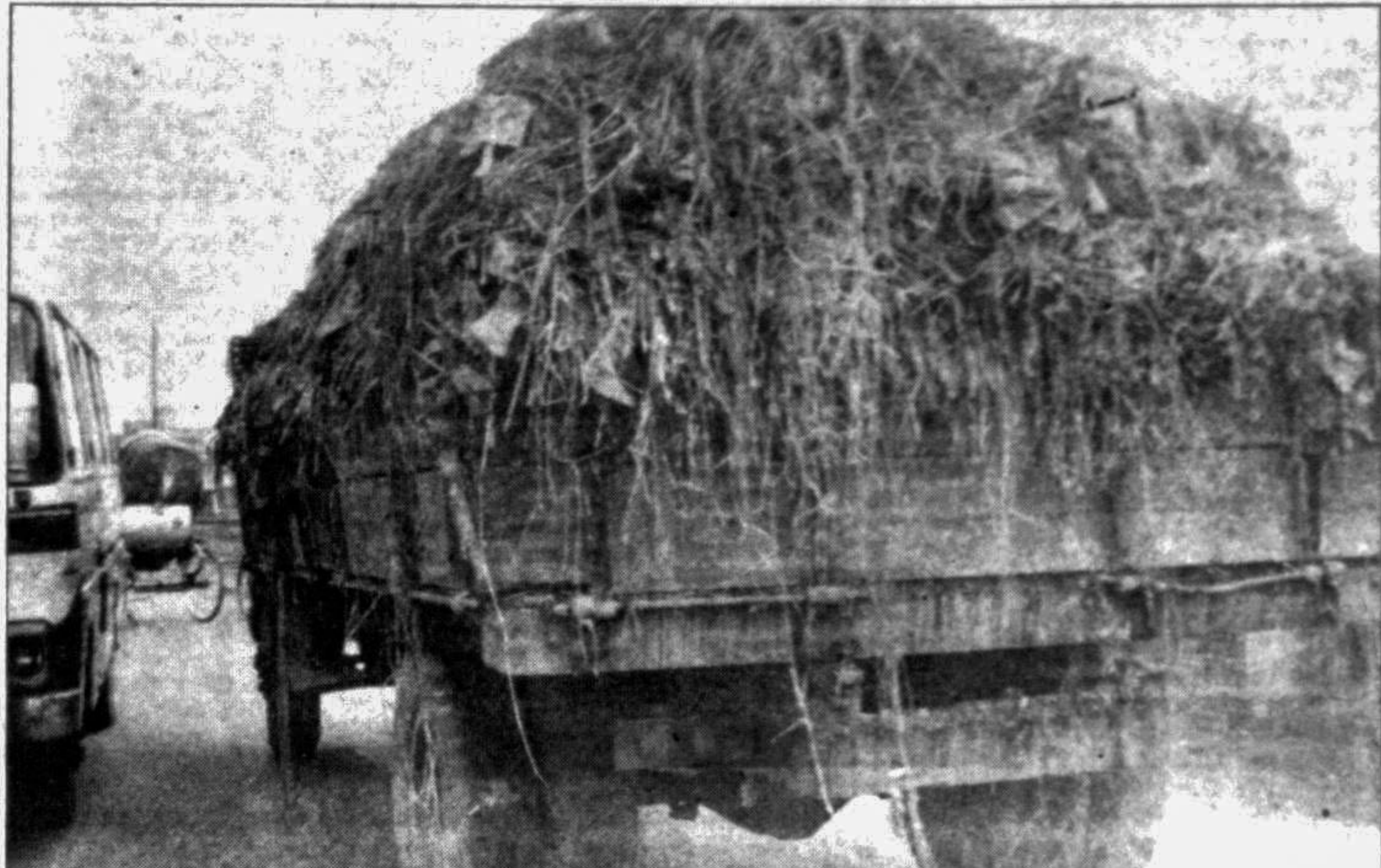
A BUMPER HARVEST OF GARBAGE—The Dhakaites have a nightmarish experience with garbage, piled up here and there daily. Although the City Corporation has of late stepped its garbage-lifting operation, things remain still in disarray. While the trucks carry tons of garbage late in the morning, spewing its odour to the passers-by, they still refuse to do away with its roots. The Star photo, taken by Enamul Haq on Saturday, shows glaringly how stubborn the trucks are in keeping up the tradition.

208,038 tonnes of wheat, 1728 tonnes of pulse and 648 tonnes of edible oil worth about US dollar 44.82 million equivalent to Taka 159 crore for Vulnerable Group Development Programme