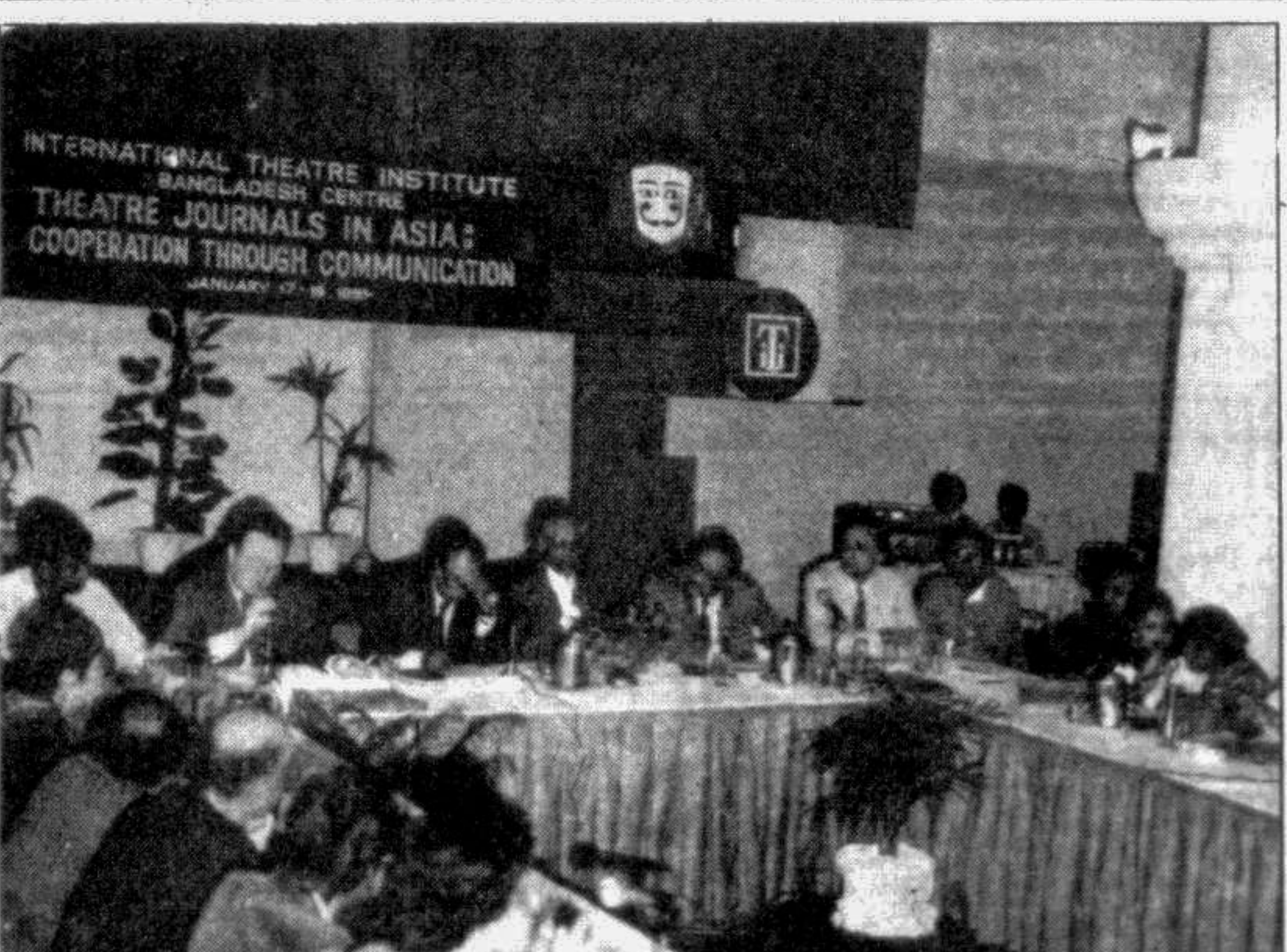
The seminar on theatre journals in Asia: Cooperation through communication, organised by the Bangladesh Chapter of the International Theatre Institute in Dhaka concluded on Friday. Foreign delegates are seen taking part in the deliberations.