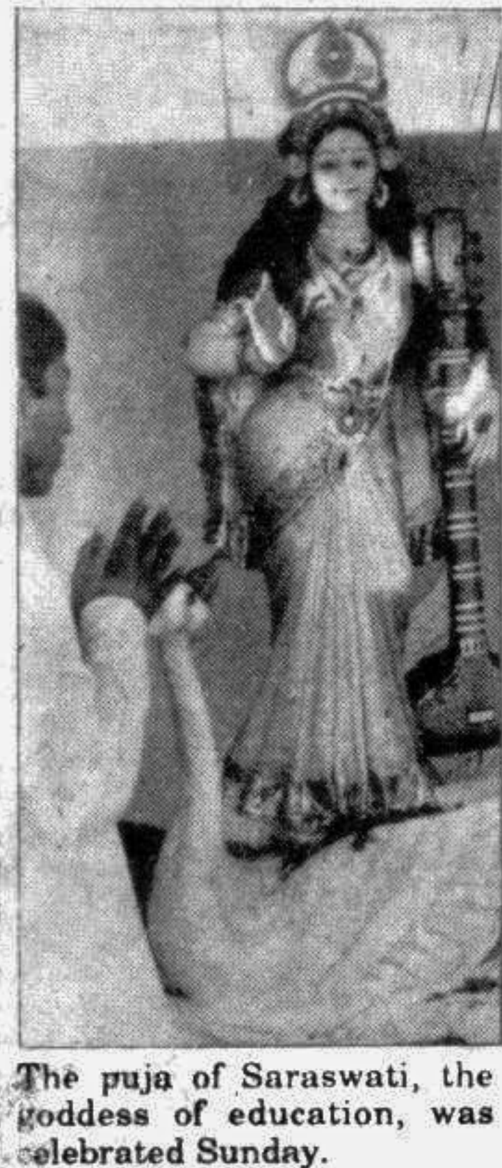
The puja of Saraswati, the goddess of education, was celebrated Sunday.