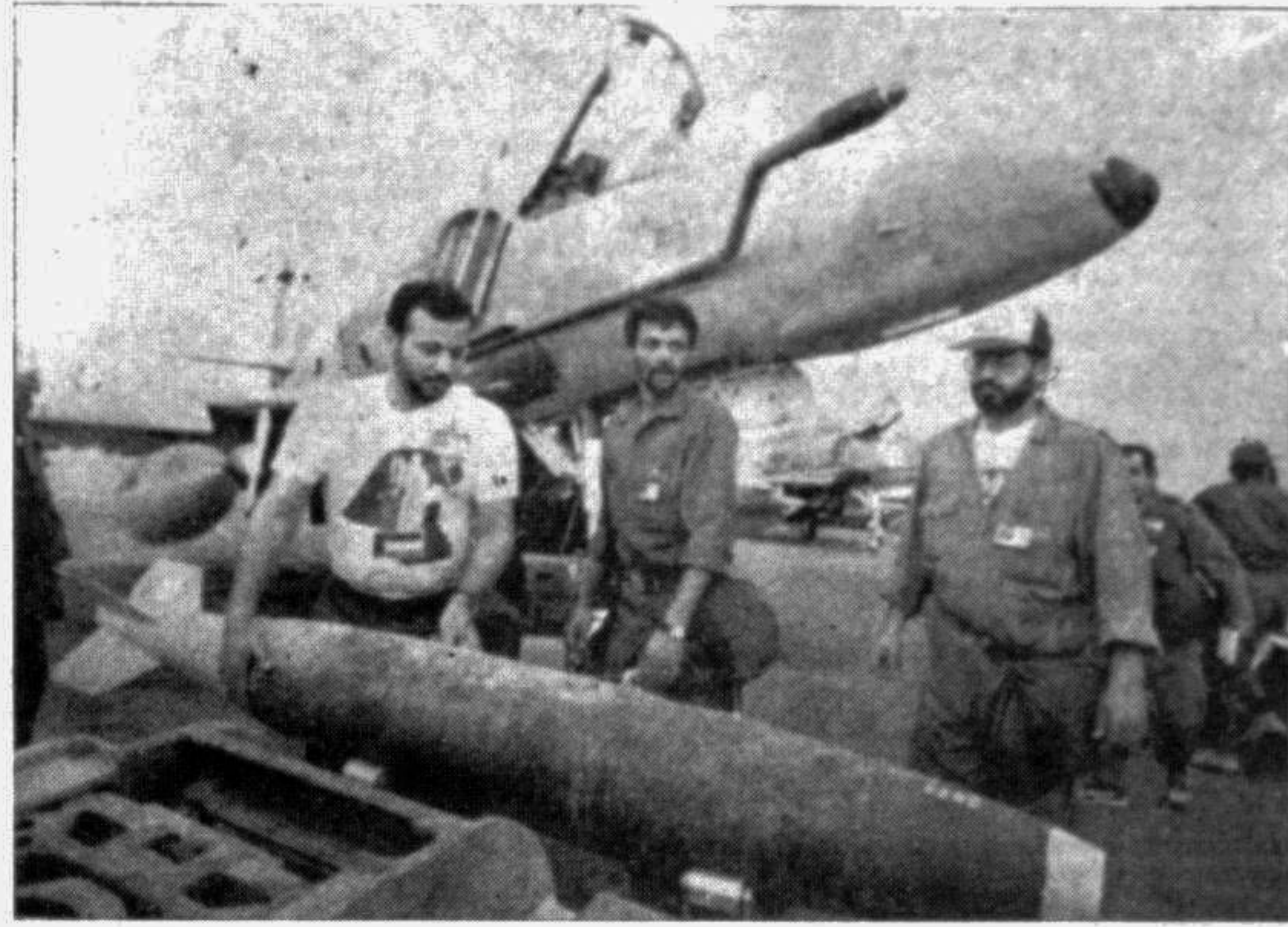
Kuwaiti Air Force crew prepare to load a 500 lbs bomb into a Kuwaiti Skyhawk jet January 19 at an air base in eastern Saudi Arabia.

States is sending a seventh aircraft carrier to the Gulf to help bolster Israel's defences against Iraqi attacks, a US government source said Sunday. The source, speaking on condition of anonymity, said the USS Forrestal, currently in a Florida Port, will be sent to the eastern Mediterranean 'in the near future'. Meanwhile, the first Iraqi missiles to hit Saudi territory landed harmlessly in the desert on Sunday, while the US military launched its biggest mission yet from Turkey against Iraq, allied officers said. Israeli planes in war AFP reports from Amman: An unspecified number of Israeli warplanes were deployed Friday at the southern Turkish air base of Incirlik, Western diplomatic sources said Sunday. The sources did not say what flight course the aircraft took to get there but noted that the dispatch of planes came hours after Iraq launched