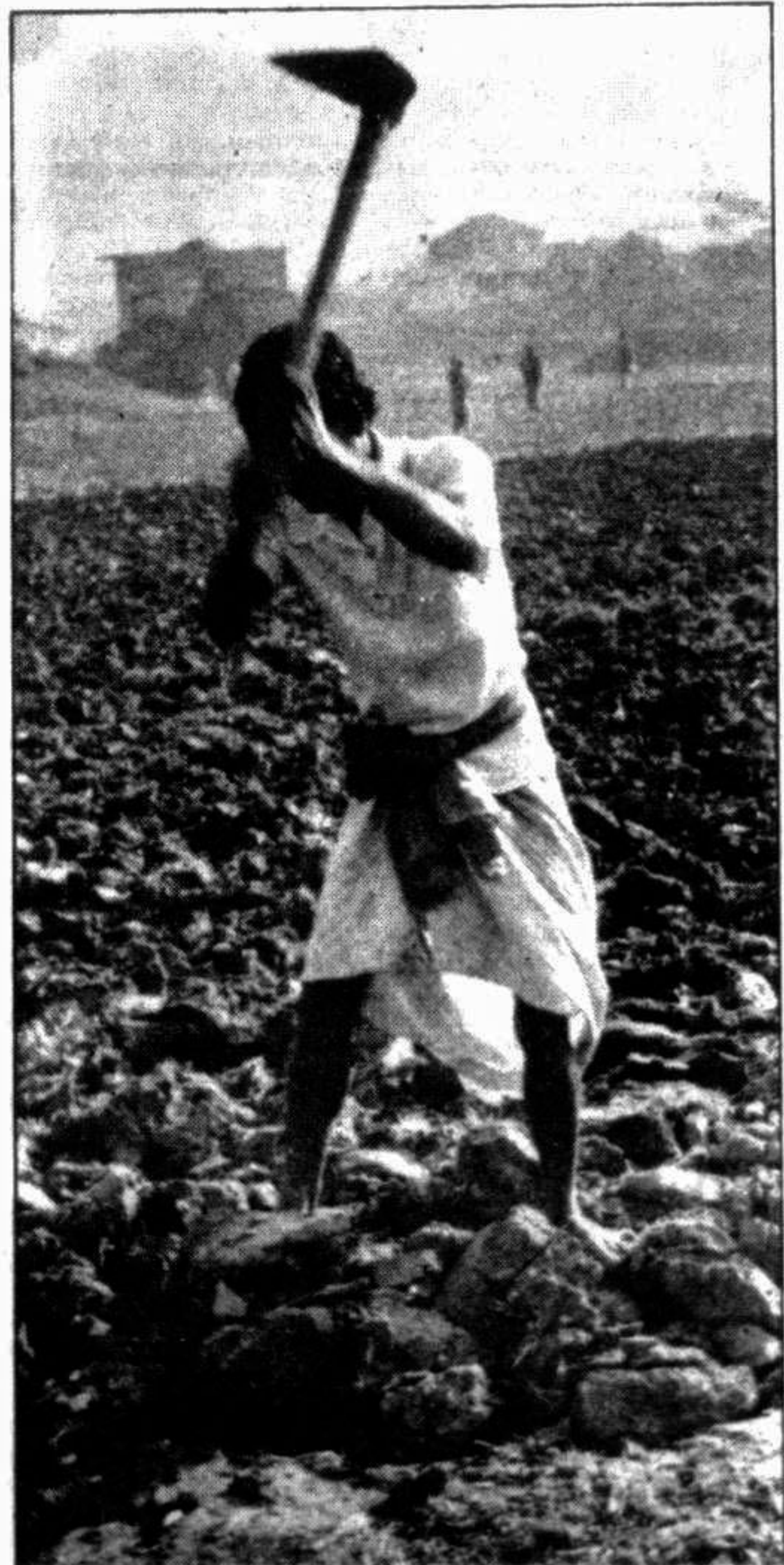
No draft cattle, but tilling cannot wait.

Indirectly, it will have a positive impact on the development of cotton spinning industry by creating additional demand for cotton yarn.