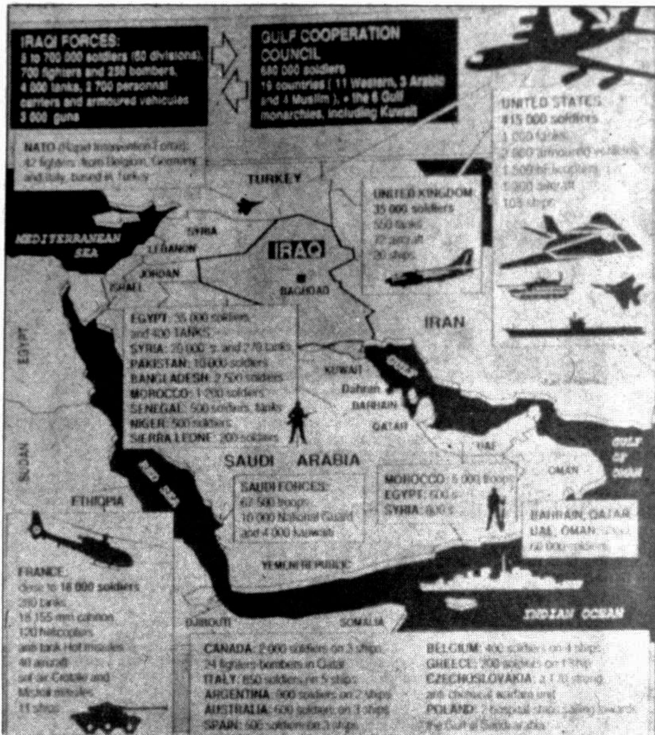
Graphic showing the presence of forces in the Gulf region.

Hundreds of allied warplanes blasted Iraqi targets Thursday, clobbering the military machine that invaded Kuwait 5/1-2 months earlier, US military officials said, report news agencies.