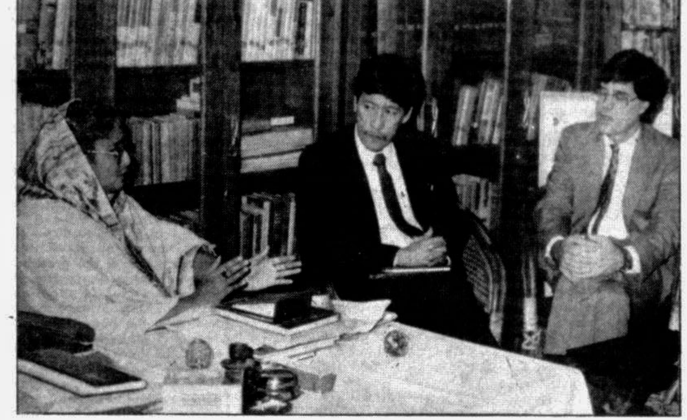
Awami League chief Sheikh Hasina briefing the members of National Democratic Institute, USA who called on her yesterday at Bangabandhu Bhaban

The speakers paid rich tributes to Sir Salimullah for his dynamic leadership to save the Muslims of the part of this sub-continent. Terming Sir Salimullah a fore-runner of Muslim Renaissance in the Sub-Continent, they said his dream could be materialised through holding free and fair elections in the country.