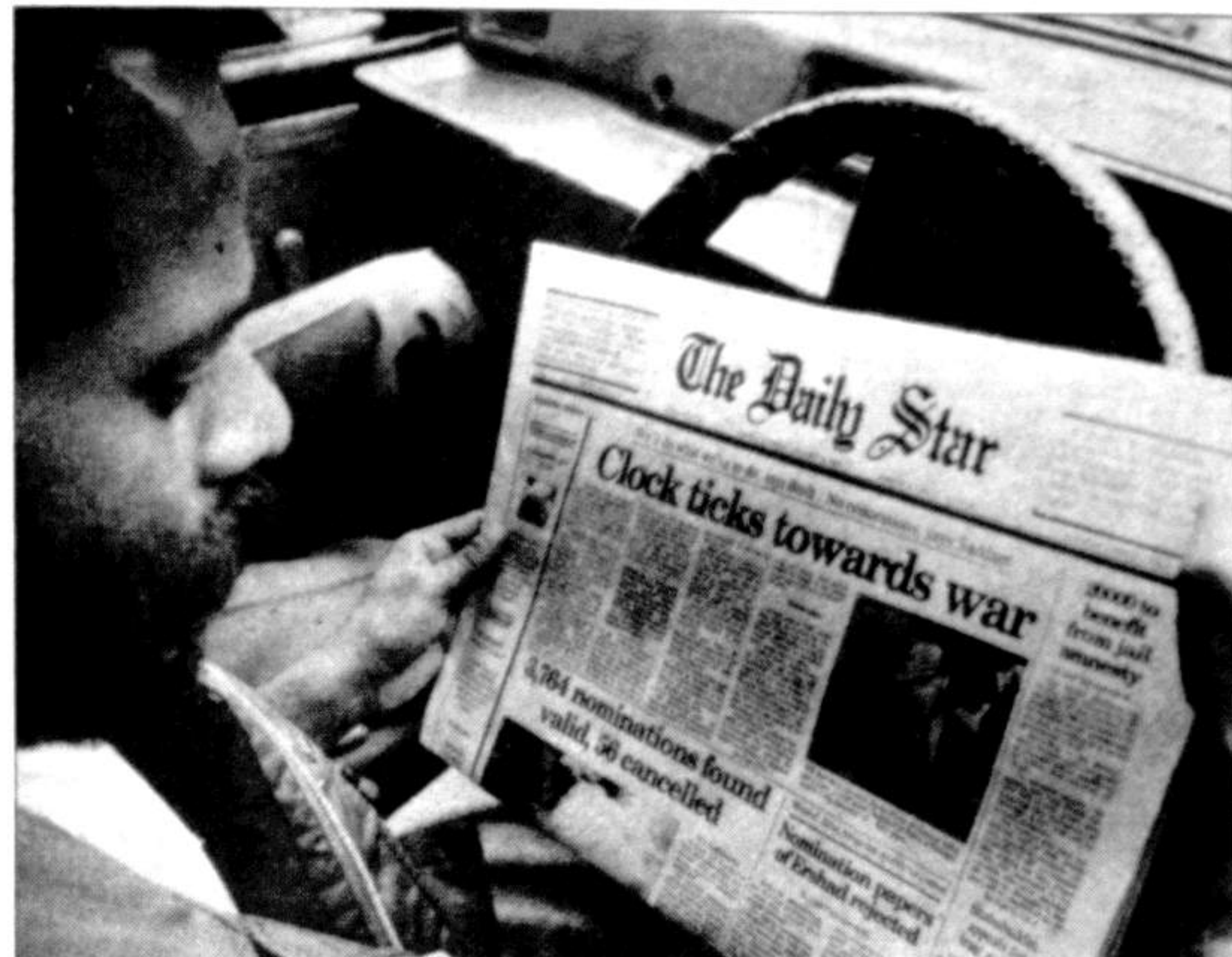
The threat of a catastrophic Gulf war has shaken all Bangladeshis including the gentleman in the car. "Clock ticks towards war" — the headline of Tuesday's issue of the Daily Star brought to the fore horrors of the war likely to hit the South Asian country hard