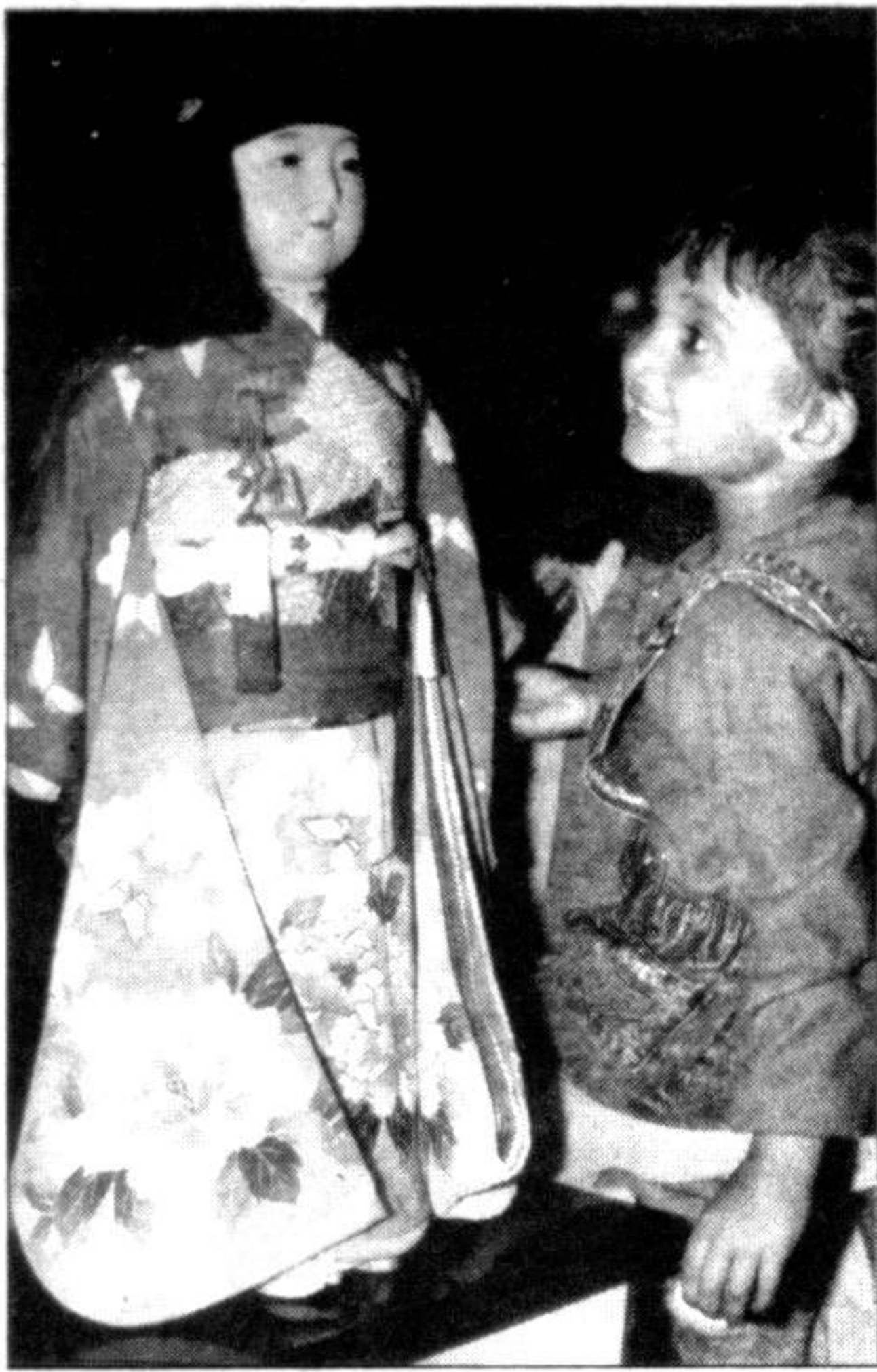
A child delights in a doll

According to Tetsuro Kitamura, an expert on the subject, the history of Japanese dolls is extremely old dating back to about 3,000 years B. C. The dolls are made from wood, paper, cloth or clay, and a wealth of techniques are employed to create a quiet beauty of expression and a rich display of colour. Because they exhibit a high-level of artistic workmanship, dolls in Japan are no longer confined to being the simple playthings of children, but have attained the status of a formative art.