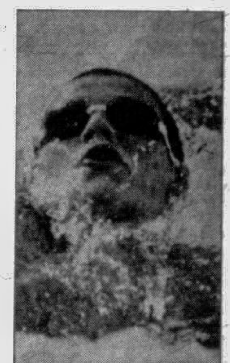
TAMAS DARNYI medals at the championships. Janet Evans and Lin Li won two apiece in women's individual races.

Darnyi became the first male swimmer to win two gold