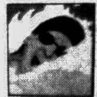
PERTH, Australia, Jan 13: The United States suffered its first big disappointment in men's races at the