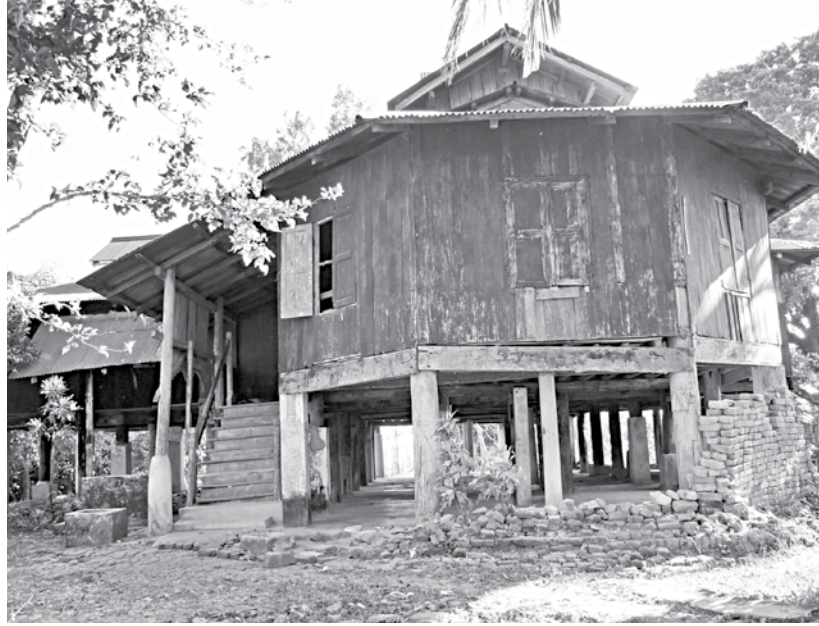
The iconic tin-roofed wooden structure of Dakkhin Hnila Boro Buddha Vihar, in Teknaf upazila of Cox's Bazar, which was razed to the ground in 2010. Right, the 150-year-old Buddha statue, made of octo-alloy, is still kept in the Ordination Hall of the temple compound.