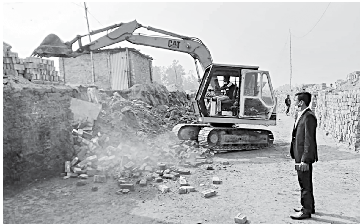
Mobile courts in separate drives fined nine brick kilns in Ghatail, Kalihati and Bhuapur upazilas a total of Tk 50 lakh for running businesses without taking legal approval from the authorities concerned. The courts also knocked down furnaces of six other brickfields in those upazilas on different ground. The photo was taken from Tangail's Ghatail upazila yesterday.