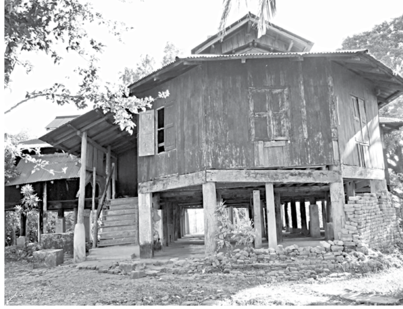
The iconic tin-roofed wooden structure of Dakhin Hnila Boro Buddha Vihar, in Teknaf upazila of Cox's Bazar, which was razed to the ground in 2010. Right, the 150-year-old Buddha statue, made of octo-alloy, is still kept in the Ordination Hall of the temple compound.