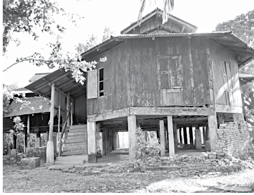
The iconic tin-roofed wooden structure of Dakkhin Hnila Boro Buddha Vihar, in Teknaf upazila of Cox's Bazar, which was razed to the ground in 2010. Right, the 150-year-old Buddha statue, made of octo-alloy, is still kept in the Ordination Hall of the temple compound.