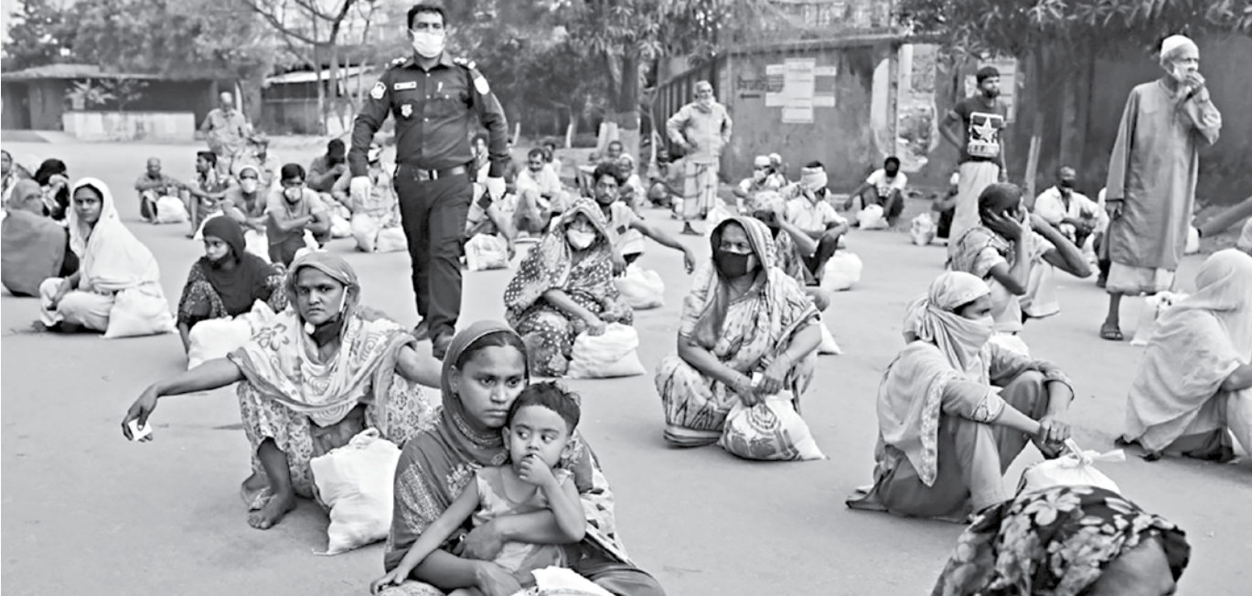
Women sit on the ground maintaining social distance while waiting to receive relief supplies provided by local police authorities in Dhaka, Bangladesh, on April 2, 2020.

Second, this stimulus should be utilised for economic revival in the long-run. The success and effectiveness of the first round of stimulus packages can be a valuable lesson for the second round. One of the lessons is that crisis of such scale and extent requires stronger fiscal measures than monetary measures. In a depressed economic situation, demand for bank loan is low. This is the time when aggregate domestic demand has to be boosted through higher public spending so that jobs are created and people have money to spend. A large number of poor people will also need cash handouts. Fiscal measures will clearly require creation of fiscal space which is currently narrow. Domestic resource mobilisation efforts have to be scaled up. Therefore, reform of the tax system will have to be pursued parallelly along with support measures to protect people's livelihoods, save businesses,