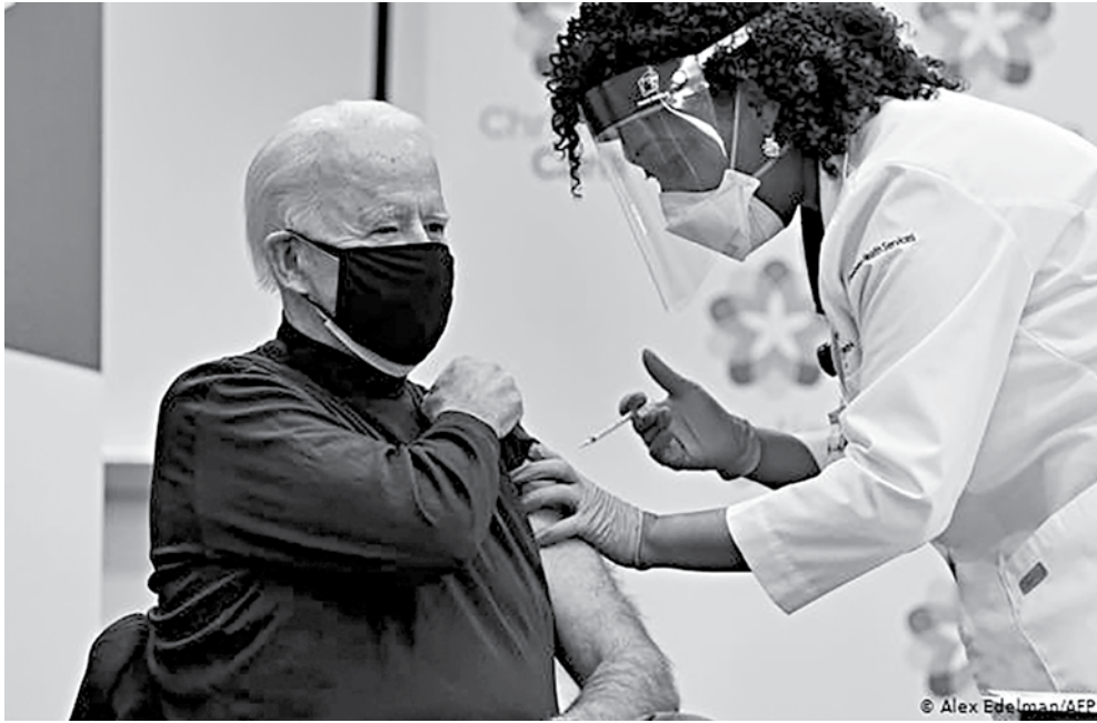
US president-elect Joe Biden received his vaccination at the Christiana Care campus in Newark, Delaware.