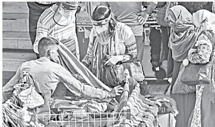
Covid-19 has caused drastic disruptions in the economy affecting the livelihoods of millions of people.

SDG 8 also asserts the need for decent jobs. Unfortunately, despite the rapid economic growth, Bangladesh has struggled to provide productive employment and decent jobs for its young labour force. In 2017, the youth unemployment rate was as high as 10.6 percent, whereas the national unemployment rate was 4.2 percent. Regrettably, the unemployment rate among the youth who had completed tertiary-level education was 13.4 percent. This implies that the education system in Bangladesh is being unable to endow young people with market-relevant skills.