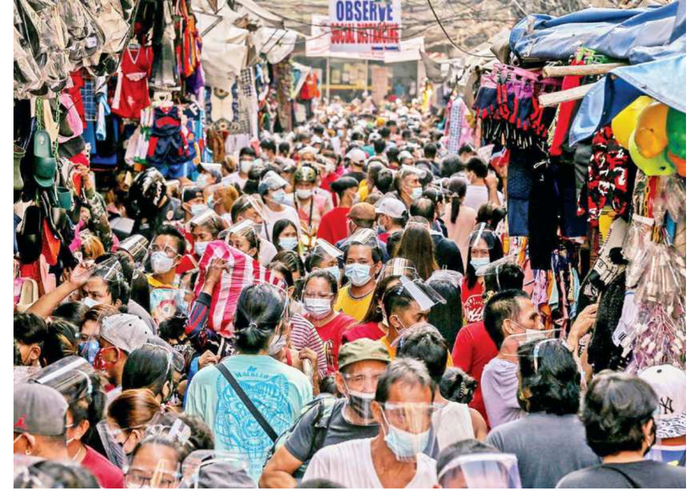
People wearing face shields and masks amid the Covid-19 coronavirus pandemic visit a popular shopping market hours before Christmas eve in Manila, yesterday.

After Soleimani's killing, the entire region held its breath in anticipation of an uncontrolled escalation which ultimately did not materialize. But tensions are rising again as the first anniversary of the strike nears and the US leader -- in his final weeks in office -- is sticking to his "maximum pressure" approach toward the Iranian regime.