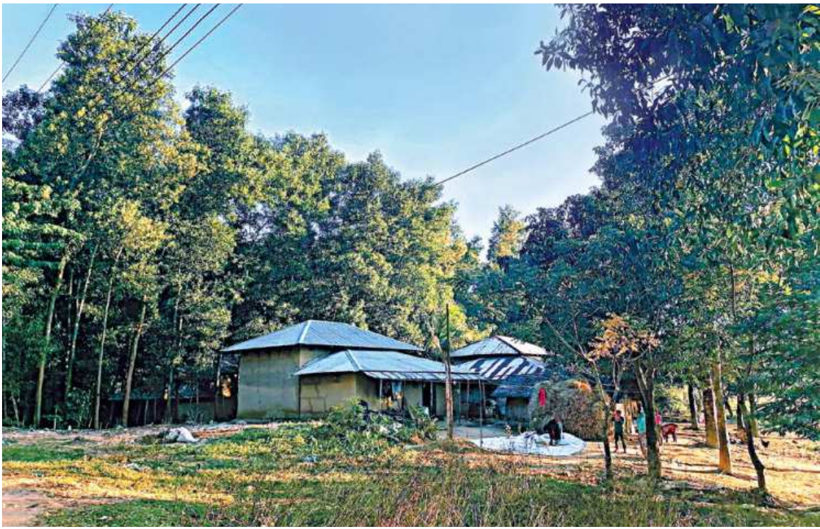
Tin-roofed mud houses amid the greenery of Chunati Wildlife Sanctuary in Cox's Bazar. Jafar Alam, a local lawmaker and also a member of the parliamentary standing committee on environment and forest, has recently proposed that 600 acres of this reserve forest be turned into khas land so that it can be leased out to the locals. The photo was taken recently.

The cadets also took formal oaths on the occasion. Bangladesh Army arranged a spectacular parade marking the occasion.