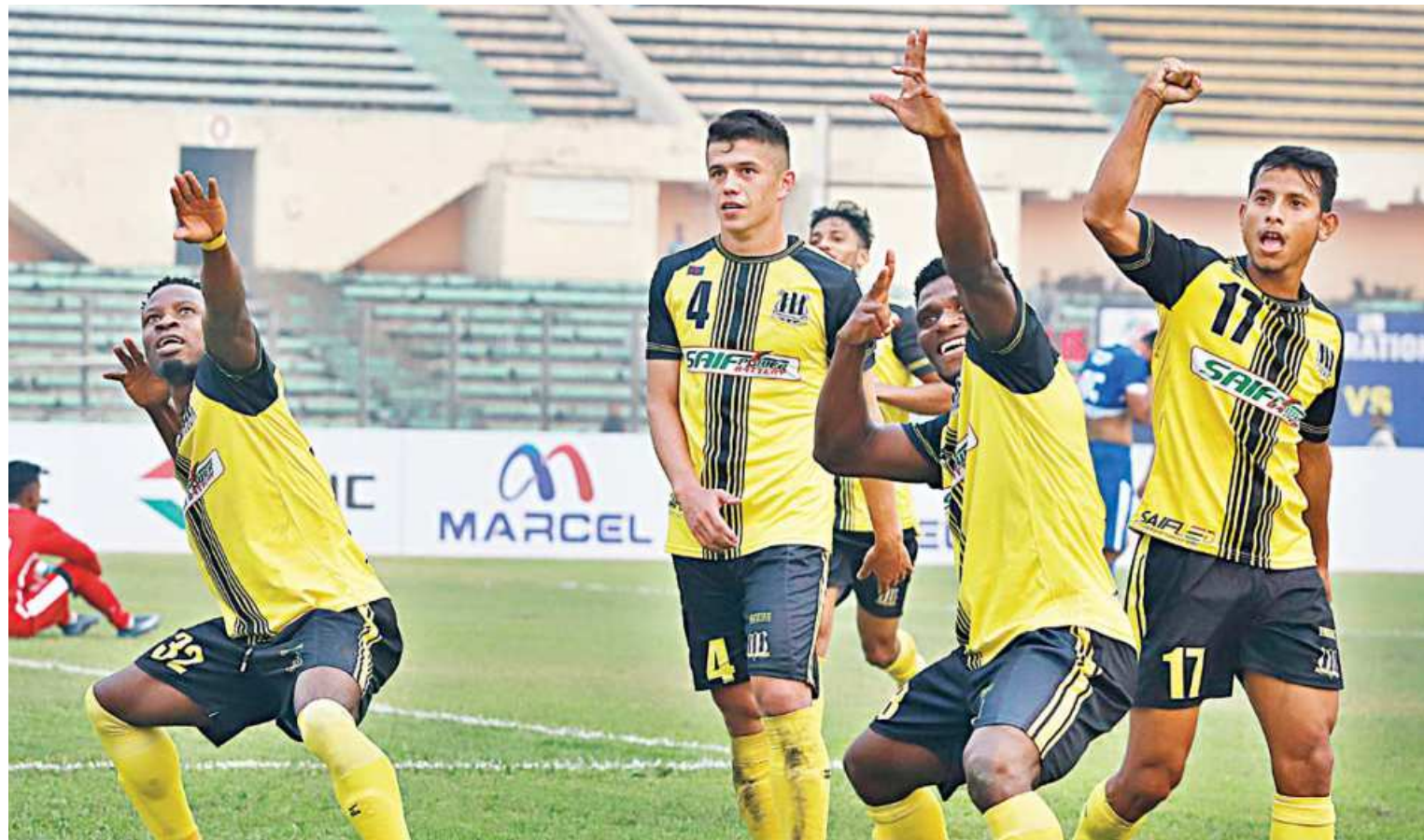
Saif Sporting Club players celebrate one of their three goals against Arambagh during their Walton Federation Cup fixture at the Bangabandhu National Stadium yesterday.