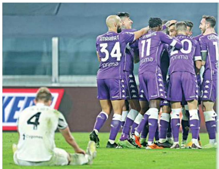
Juventus defender Matthijs de Ligt is on the ground as Fiorentina players celebrate one of their three goals at the Allianz Stadium in Turin on Tuesday.

"I played a lot of cricket where I was struggling, so I didn't have time to reflect on things that maybe worked in the past and just slow things down," he said.