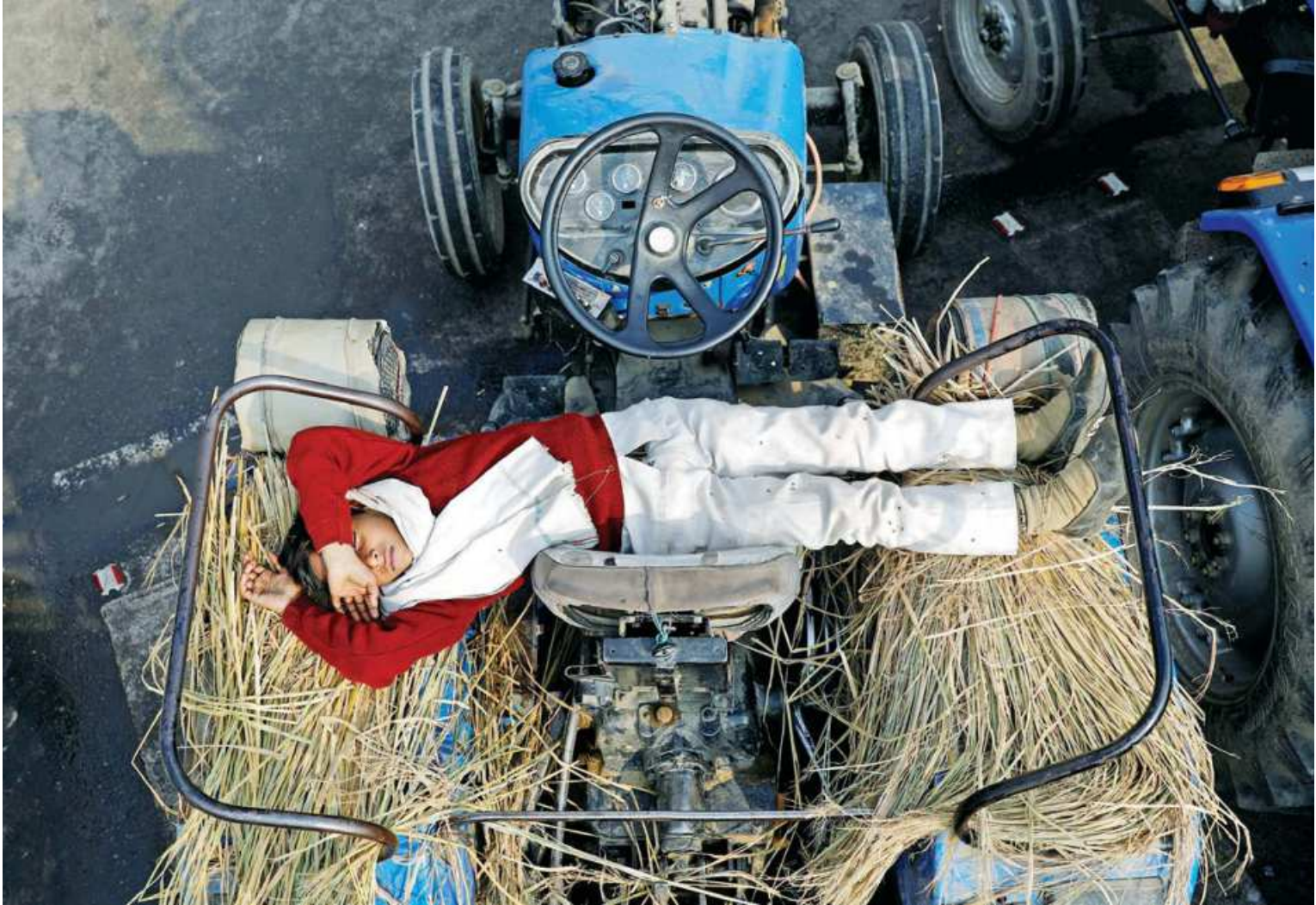
A farmer's son sleeps on a tractor at the site of a protest against new farm laws, at the Delhi-Uttar Pradesh border in Ghaziabad, India, yesterday. Farmers are protesting against three farm laws for nearly a month that they say are against their interest.

"We are going from bad to worse," Ryabkov said.