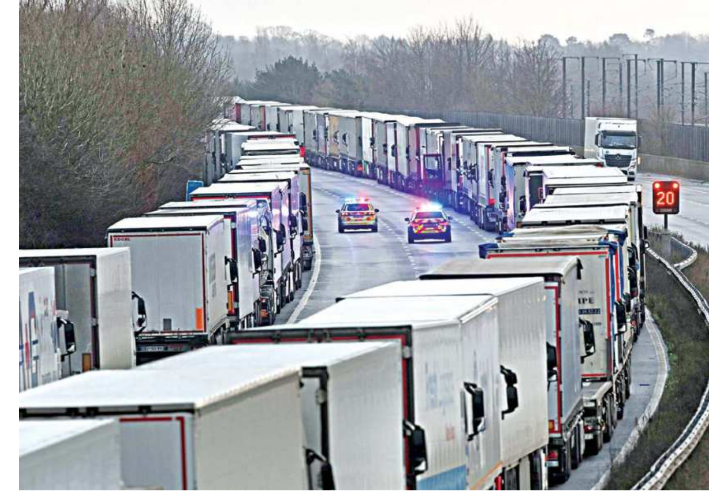
Police cars patrol as freight lorries and goods vehicles queue on a closed section of the M20 motorway which leads to the Port of Dover, near Ashford in Kent, south east England yesterday, after a string of countries banned travel including accompanied freight arriving from the UK, due to the rapid spread of a more-infectious new coronavirus strain there.

Republican US Senator Mitt Romney said a widespread data breach across the US government was "extraordinarily damaging" and that President Donald Trump has a "blind spot" when it comes to Russia.