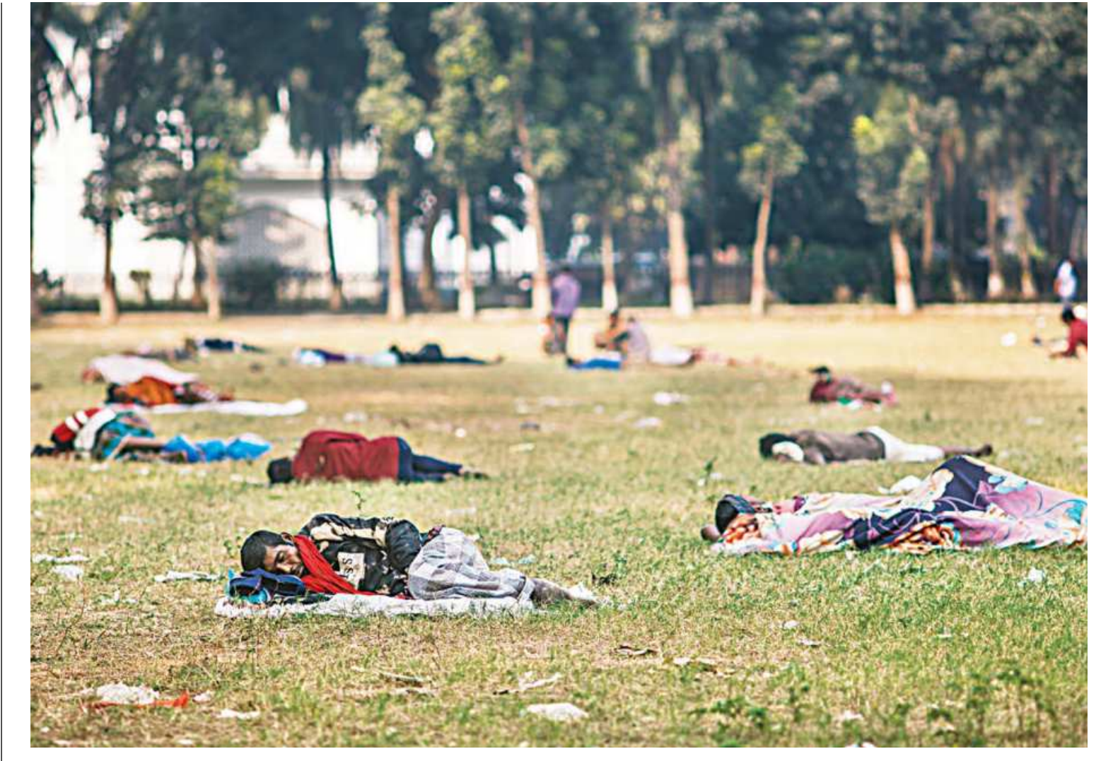
Finding no other way to fight the winter chills, many often come to lie down under the sun's warmth at the capital's Eidgah, beside the High Court. People in need of blankets, sweaters and roofs above their heads suffer the most when the temperature drops. This photo was taken on Sunday.

development work, the mayor said. SEE PAGE 4 COL 2