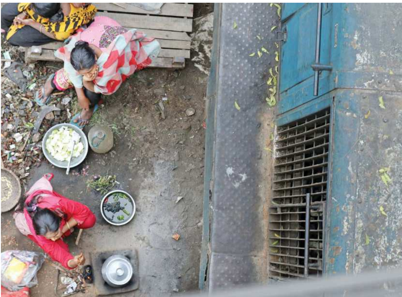
A woman cooks a meal while a train passes by with inches to spare in the capital's Tejjagon. Homeless people living along railway lines in the city are exposed to accidents and cold temperatures as they struggle to make ends meet. The photo was taken recently.