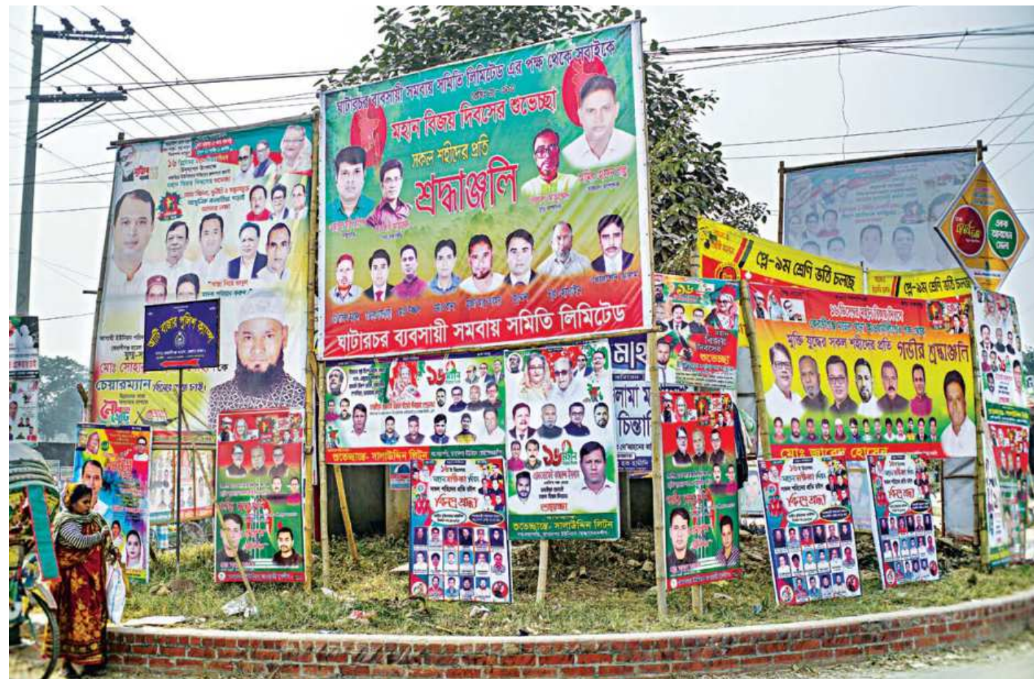
A large number of PVC banners, mostly of the ruling Awami League leaders, hanging at Shaheed Smriti Square in the capital's Basila area. Such banners decrease visibility and increase the chance of accidents at the spot. The signboard directing people to a police station is lost amid the bright banners. The photo was taken yesterday.