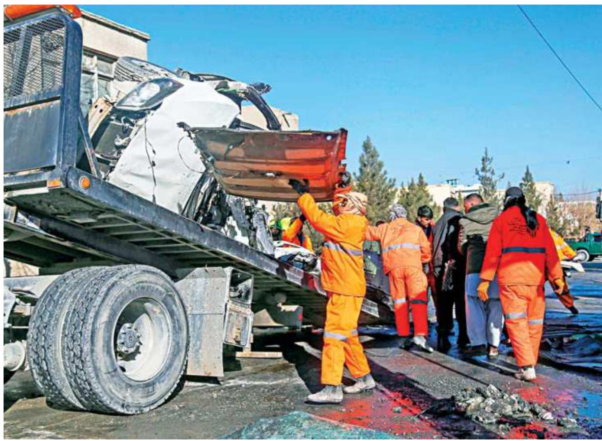
Municipal workers clean up debris at the site of a bomb attack in Kabul, Afghanistan yesterday. Four doctors who worked at an Afghan prison with hundreds of Taliban inmates were among five people killed when a bomb attached to their car exploded, police said. At least 20 people were injured in the attack.

India's three main cities, New Delhi, Kolkata and Mumbai, were on the list of the world's 20 worst polluted cities, Swiss air quality technology company IQAir reported yesterday.