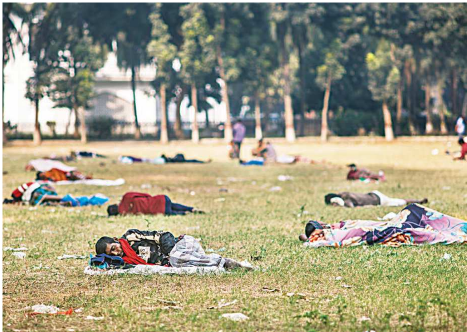
Finding no other way to fight the winter chills, many often come to lie down under the sun's warmth at the capital's Eidgah, beside the High Court. People in need of blankets, sweaters and roofs above their heads suffer the most when the temperature drops. This photo was taken on Sunday.