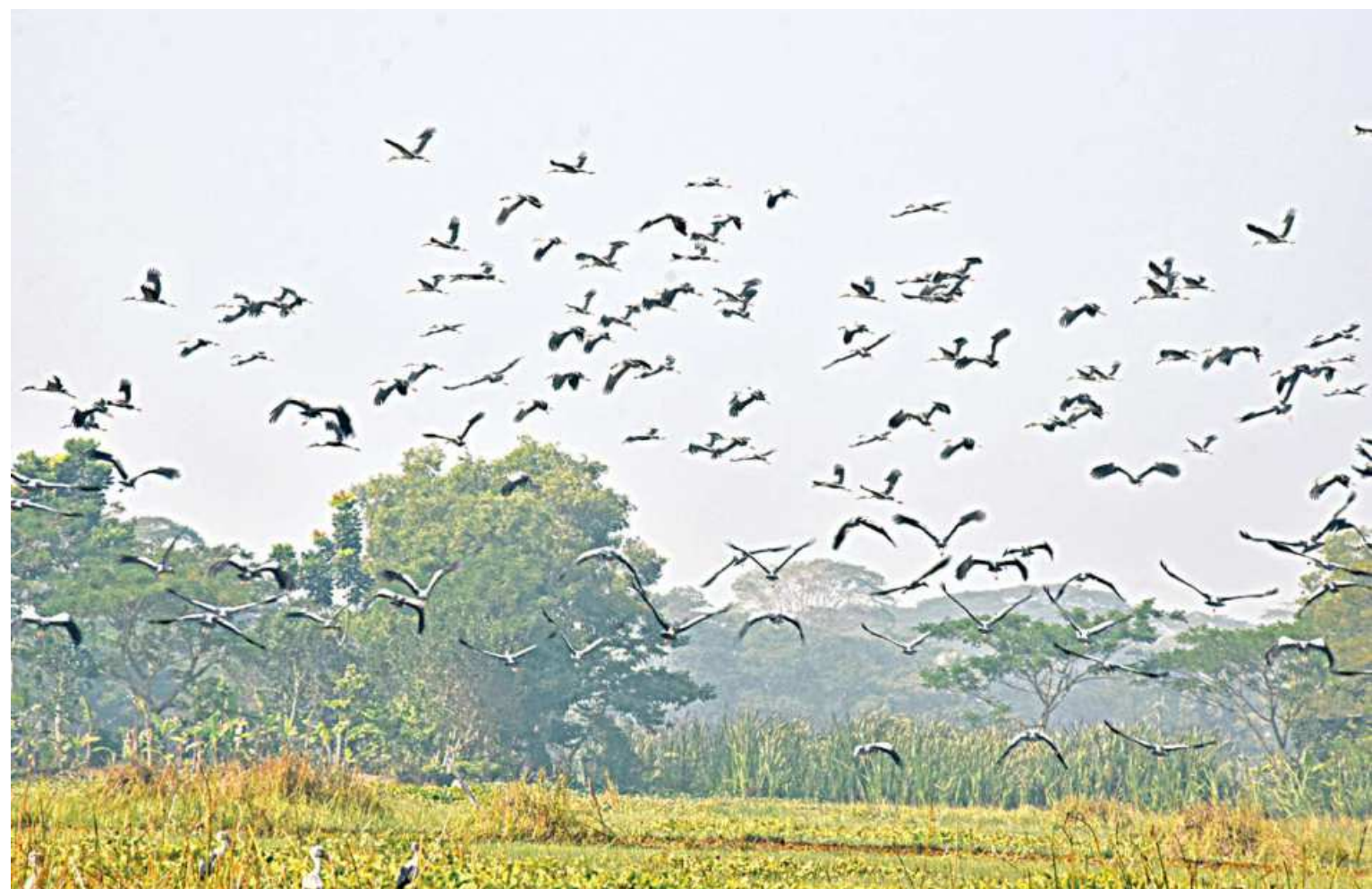
This might seem like a graceful scene, but these open-bill storks -- locally known as Shamuk Khol -- are in motion out of desperation. The severity of cold during Poush has driven them to come flock at Bakshirchar village of Chandpasha union. This photo was taken on Sunday from Barishal's Babuganj upazila, of which Bakshirchar village is a part.