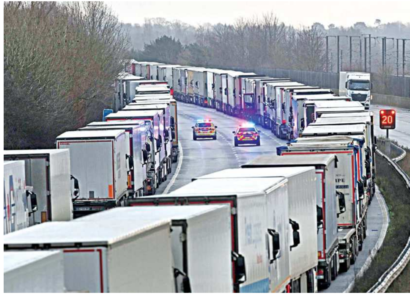
Police cars patrol as freight lorries and goods vehicles queue on a closed section of the M20 motorway which leads to the Port of Dover, near Ashford in Kent, south east England yesterday, after a string of countries banned travel including accompanied freight arriving from the UK, due to the rapid spread of a more-infectious new coronavirus strain there.

Republican US Senator Mitt Romney said a widespread data breach across the US government was "extraordinarily damaging" and that President Donald Trump has a "blind spot" when it comes to Russia.