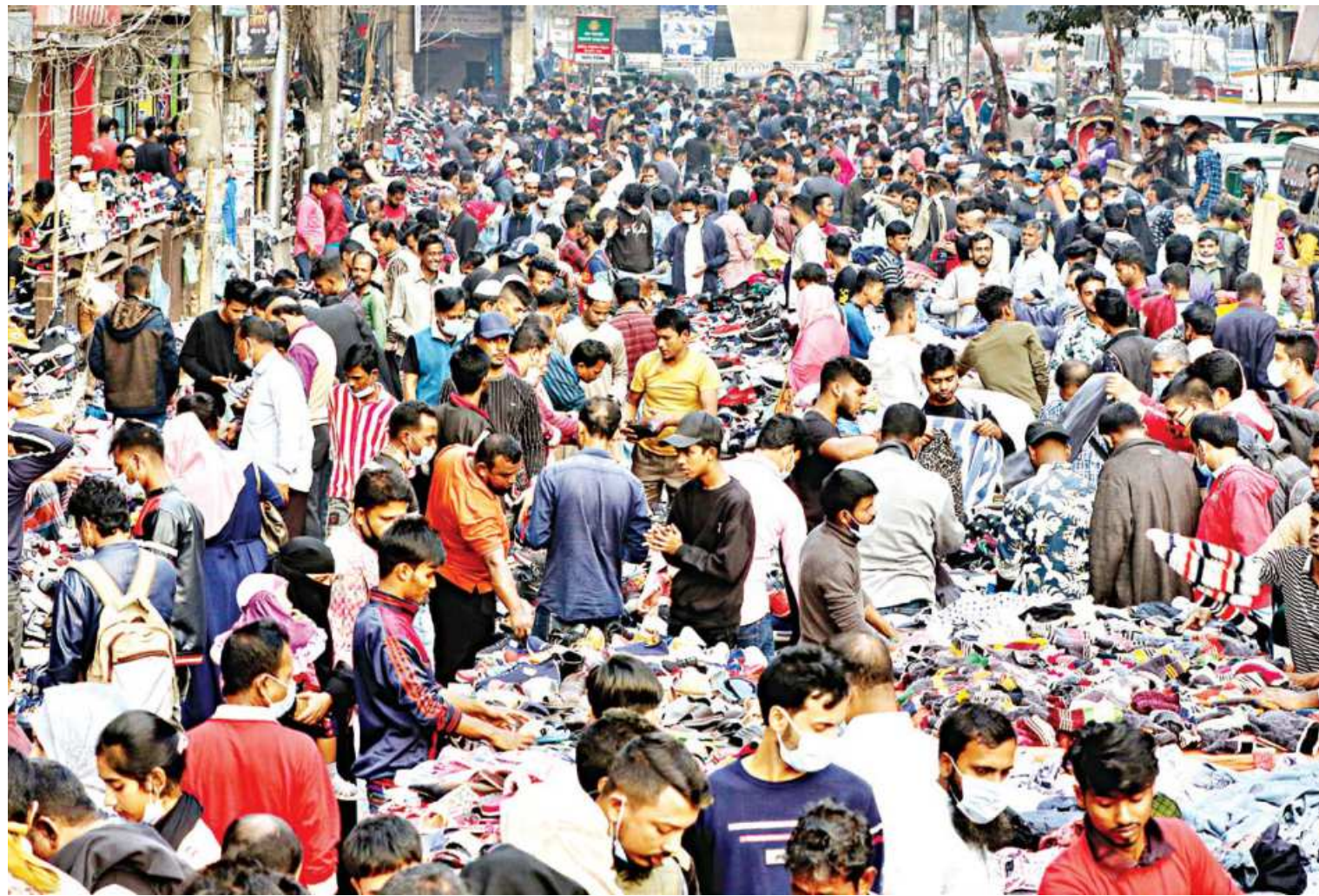
People through a road near Gulistan underpass in the capital yesterday to buy warm clothes without following health safety rules. A lane of the road is occupied by hawkers, causing a tailback. Such blatant violation of health safety rules remains a major concern for the authorities as the country is seeing a rise in Covid-19 infections.