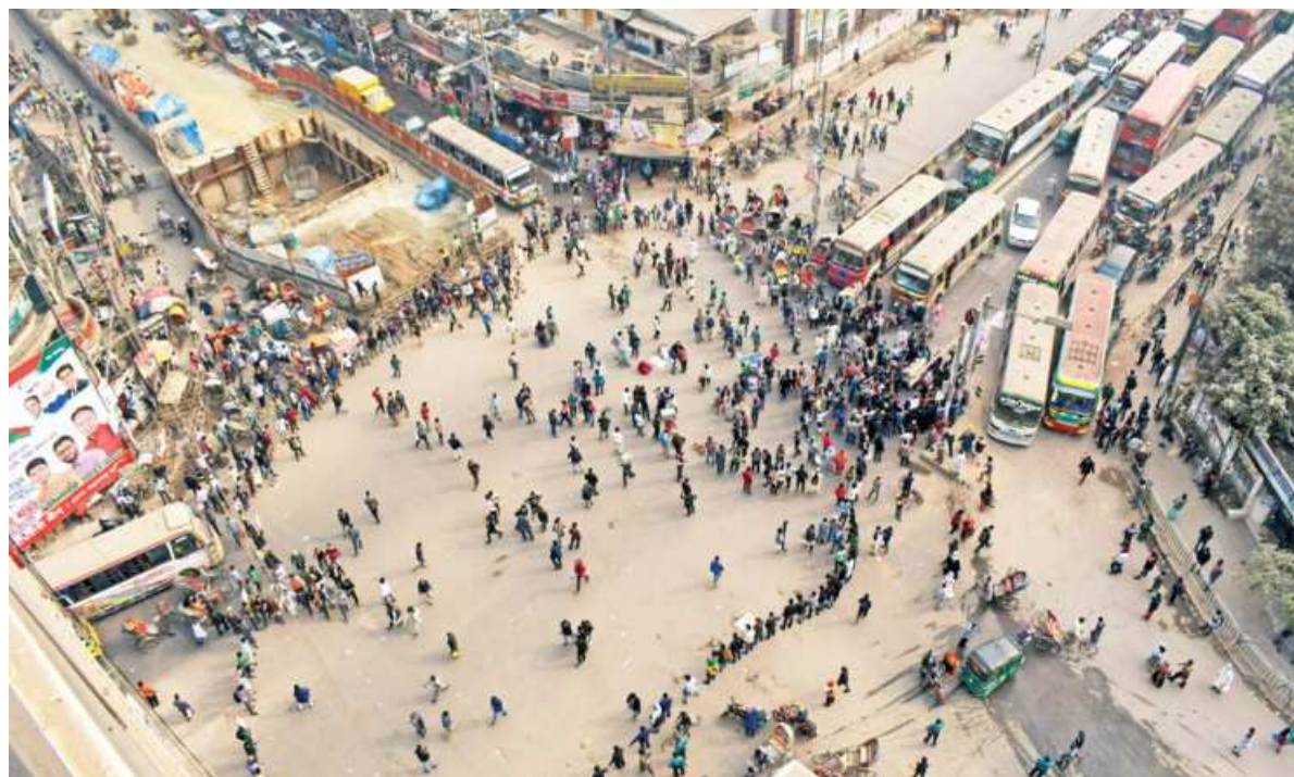
Members of Bangladesh Chhatra Adhikar Parishad block Paltan intersection in the capital yesterday protesting what they say is the impunity for the attackers of their leaders at Ducusu Bhaban of Dhaka University a year ago. Movement of traffic was disrupted in the area for about half an hour.

Our Nilphamari correspondent contributed to this report.