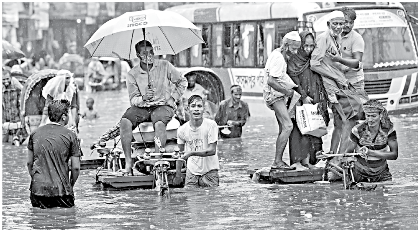
Haphazard urban planning and drainage congestion means Dhaka is prone to flooding after a heavy downpour. This photo was taken in Dhaka's Doyaganj area in July 2020.

Finally, let me end on an optimistic note which is to do with the youth, especially the girls of our country. They are, in my opinion, by far the biggest assets in our country and we need to invest in them in a non "business as usual" manner. This will not require a