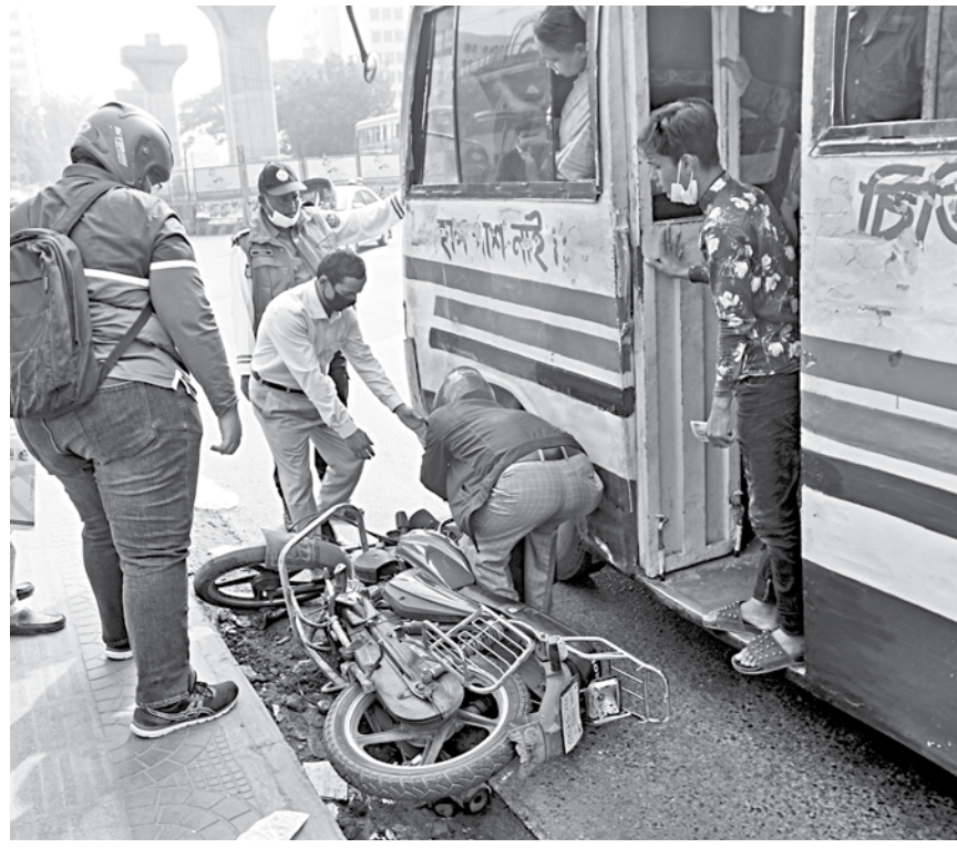
Competing over who gets to go first after the traffic light turned green, this motorbiker fell into a roadside drain trying to avoid hitting the bus. This photo was taken on Monday from the capital's Paribagh area.