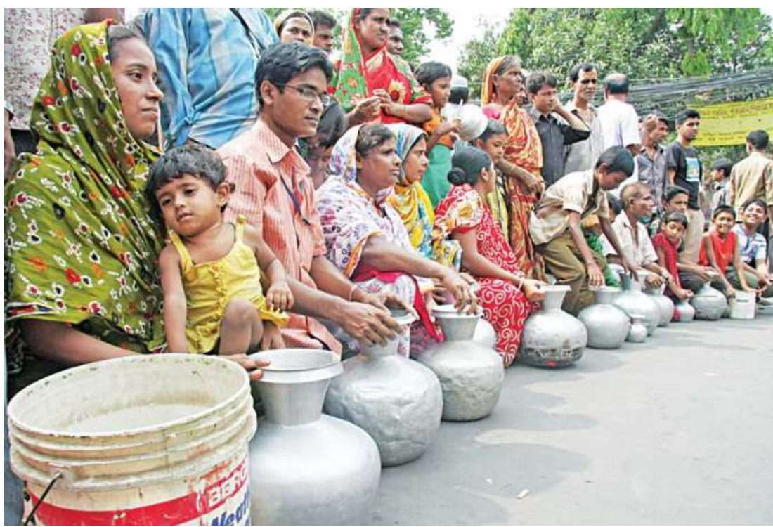
Bangladesh has made significant progress on universal access to improved water sources. But access to safe drinking water is still low.