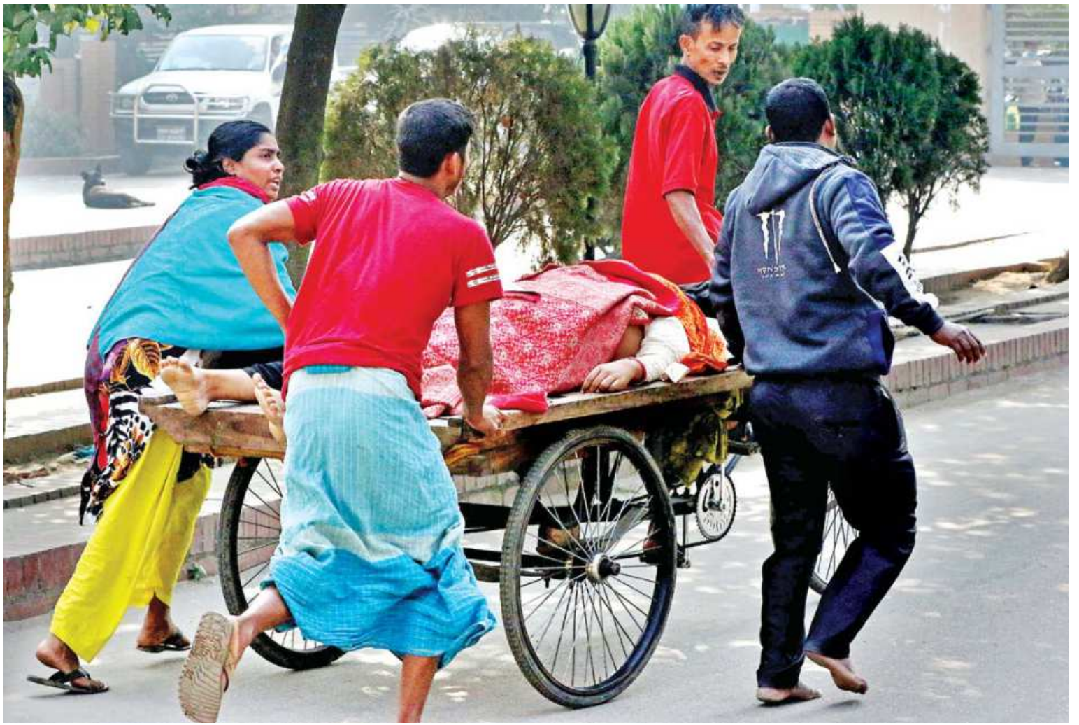
Relatives of a woman try to rush her to Dhaka Medical College Hospital from Mugda Medical College and Hospital in a rickshaw van yesterday. The unconscious woman was brought to the Mugda hospital from Uttar Manda on this van. Doctors there referred her to DMCH.