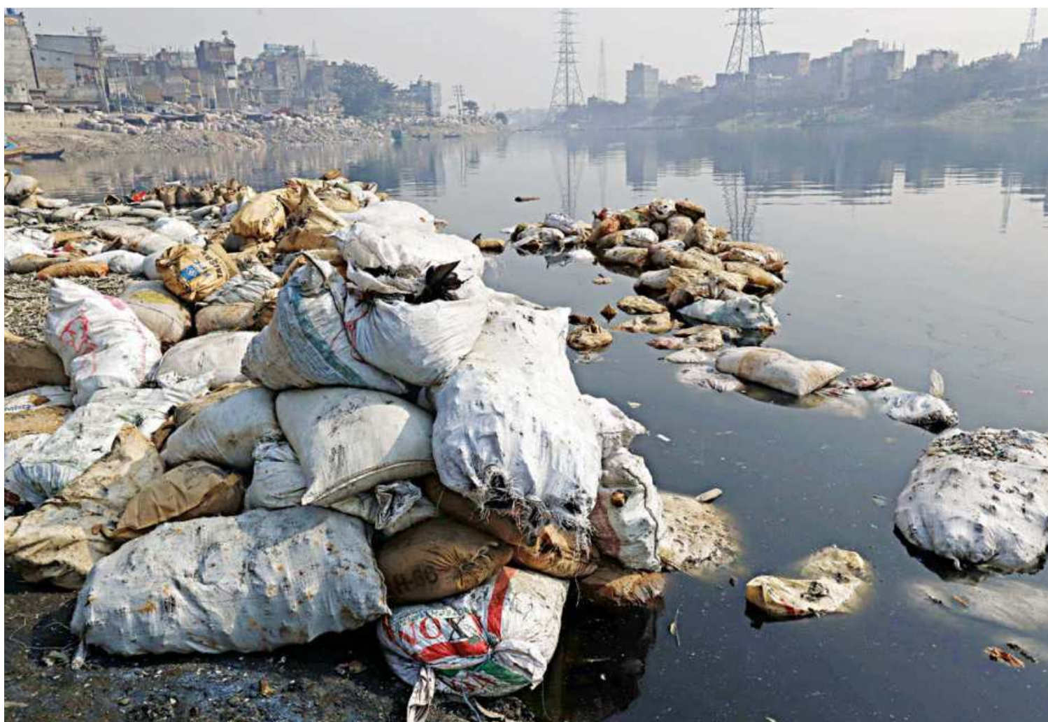
Sacks of garbage, mostly single use plastic bottles, are dumped in the Buriganga river near Islambagh in the capital. It has been going on for so long that quite a bit of the river has been filled up. The photo was taken yesterday.