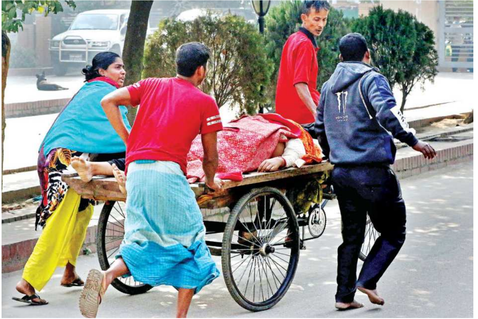
Relatives of a woman try to rush her to Dhaka Medical College Hospital from Mugda Medical College and Hospital in a rickshaw van yesterday. The unconscious woman was brought to the Mugda hospital from Uttar Manda on this van. Doctors there referred her to DMCH.