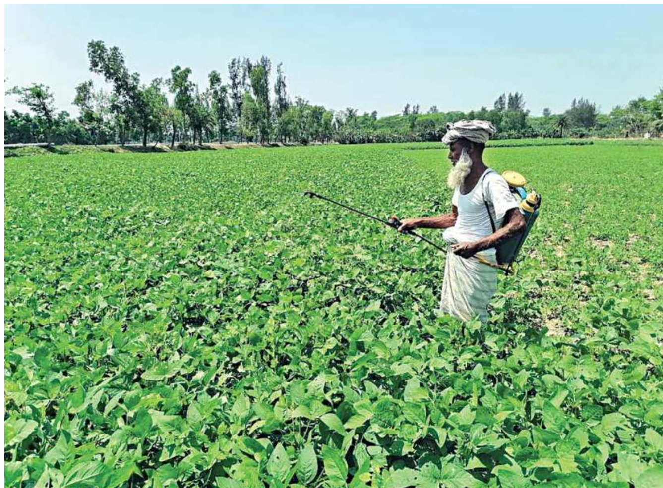
A farmer sprays pesticides in his soybean field to control pests. The photo was taken from Char Hasan village of Subarnachar upazila in Noakhali.