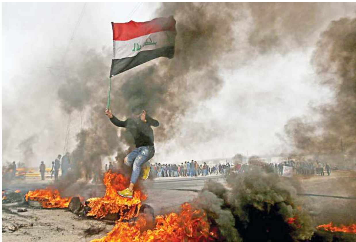
An Iraqi demonstrator jumps over a burning tire during anti-government protests in Basra, Iraq yesterday.