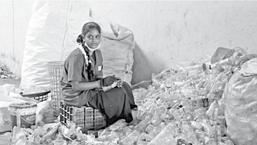
An example of a contextually smart solution is Kabadiwalla Connect, a set of mobile apps that have been developed in India to address urban waste.