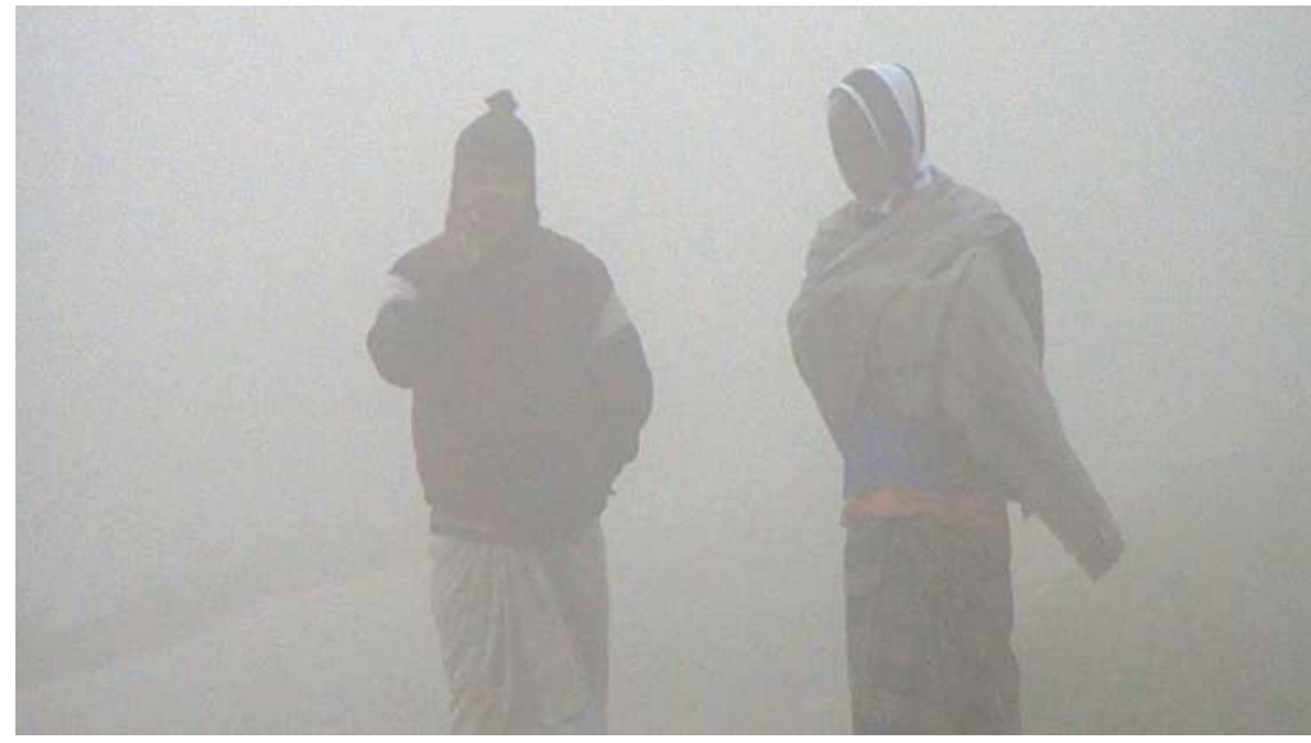
Even though just a few feet away, two locals in Lalmonirhat Sadar upazila's Roypara village are barely visible because of the thick fog that covered the area like a blanket yesterday morning.

He refused to make any comment when asked if they would take any steps against the eminent personalities.