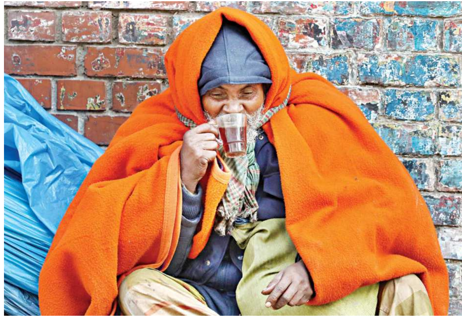
An elderly man, wrapped in a blanket, taking a sip of tea to keep himself warm in the unbearable cold yesterday. Many homeless people like him are suffering immensely due to the cold wave that has been sweeping over the country recently. The photo was taken near Kamalapur Railway Station in the capital yesterday.

AGENCIES The United States has authorised Moderna's Covid-19 vaccine for emergency use, paving the way for millions of doses of a second jab to be shipped across the hardest-hit country in the world. The latest breakthrough came as many governments clamp down on socializing over Christmas and New Year, which is expected to fuel a jump in virus deaths in early 2021. Italy on Friday announced harsh new restrictions over the holidays with many shops and all bars and restaurants closed, travel between regions banned, and only one daily outside trip per household permitted. A quarter million people in Sydney's northern beach suburbs were ordered yesterday into a strict lockdown until Christmas Eve to help contain a coronavirus cluster with authorities fearing it may spread across Australia's most populous city. With the United States now registering over 2,500 deaths a day from Covid-19, senior US officials including Vice President Mike Pence stepped up to receive early vaccinations on Friday. Pence's public inoculation was the most high-profile attempt yet at persuading vaccine-skeptic Americans to