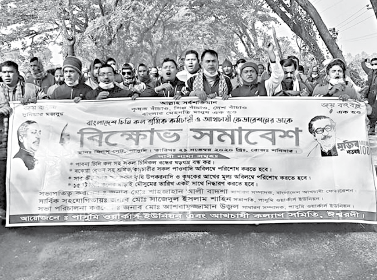
Sugarcane growers and workers and employees of Pabna Sugar Mill bring out a protest rally in front of the mill gate yesterday morning, demanding to resume sugar cane crashing. The angry protesters also tried to put barricades on the Pabna-Rajshahi highway that disrupted vehicular movement for several times.