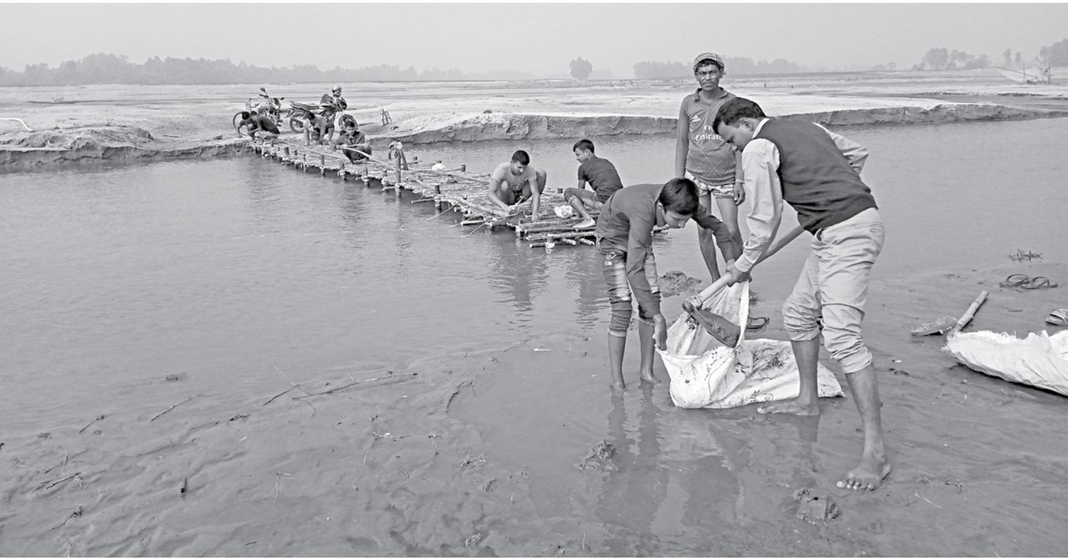
Volunteers building a bamboo walk bridge on a shallow channel of the Brahmaputra river in Char Rajibpur upazila of Kurigram.