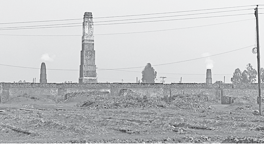
Brick kilns in Chilmari upazila of Kurigram have been built on farmland, violating rules.