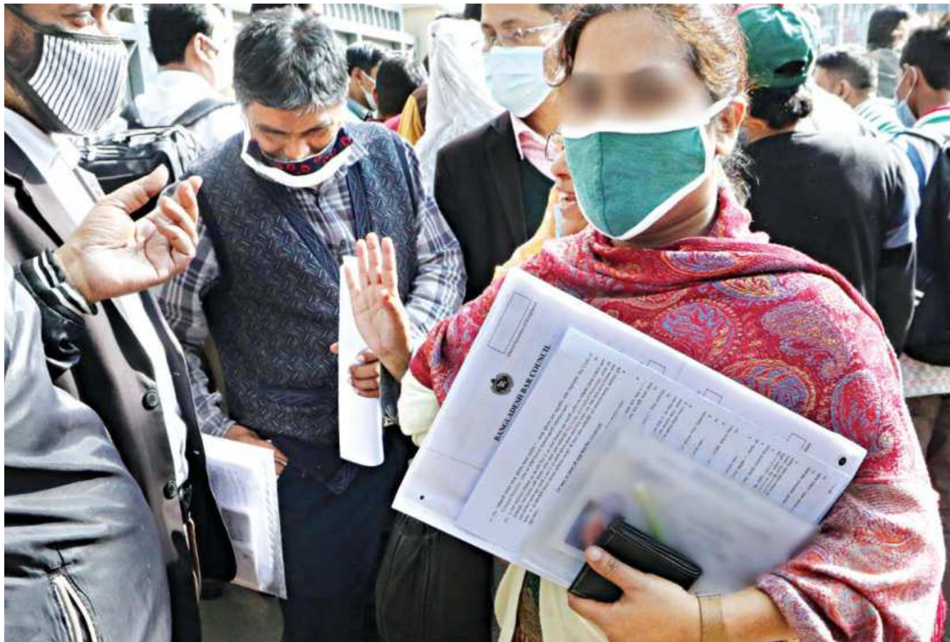
A law graduate comes out of the Bar Council enrolment exam hall with her answer scripts at Mahanagar Mohila College in the capital yesterday. A section of the graduates created chaos at the centres for the exam claiming the questions were too hard and demanding "auto-pass". The woman's face and ID card have been blurred to protect her identity.