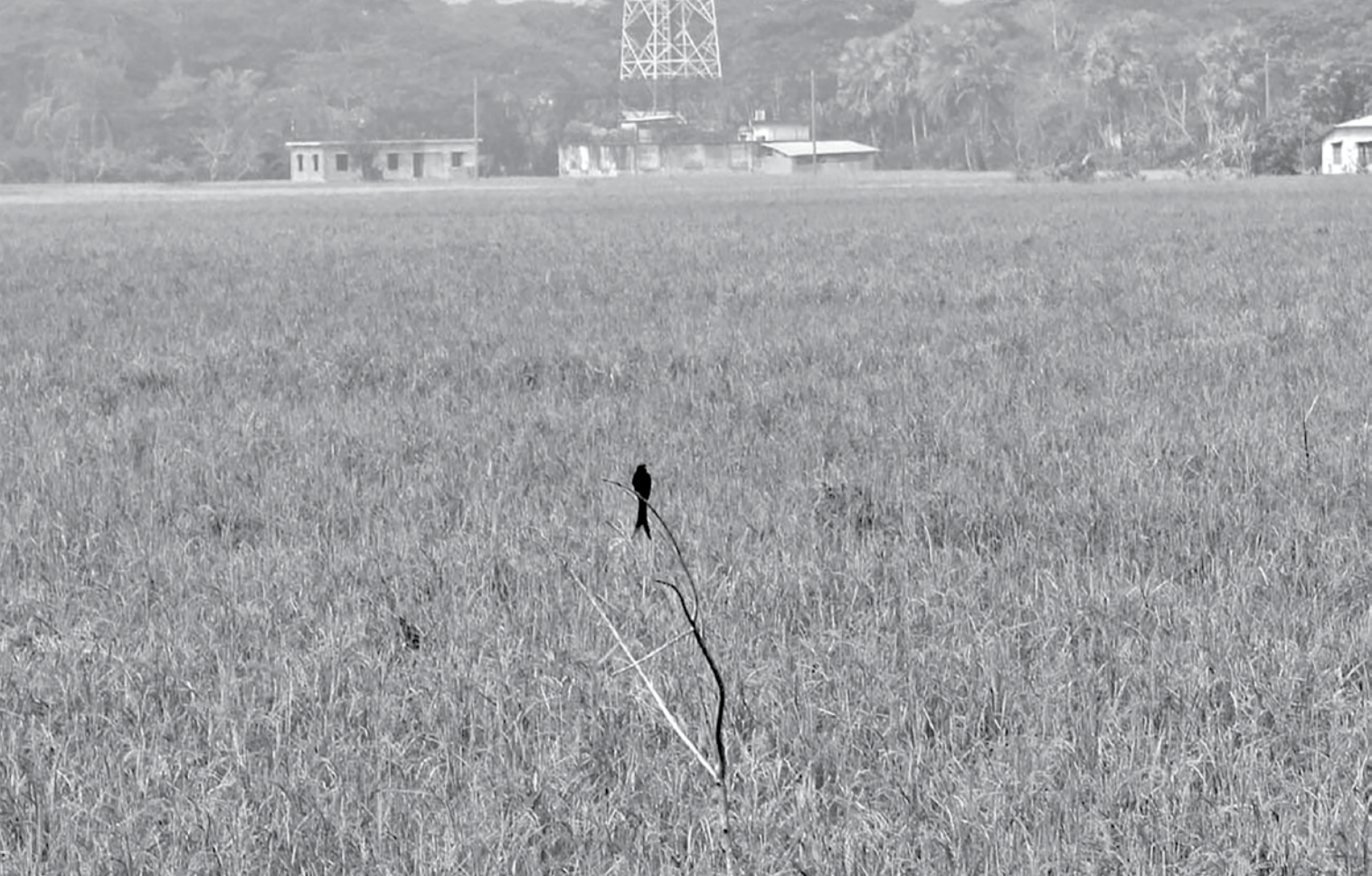
A black drongo roosting on a perch set up in an Aman field at Badorpur village of Patuakhali Sadar upazila.