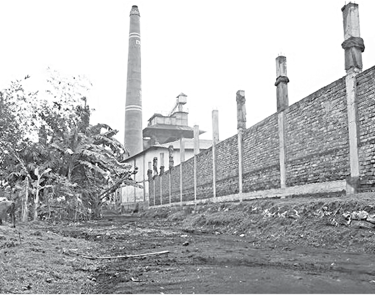
Azizul Islam Auto Rice Mill, one of the government enlisted mills situated in Sarkarpara area in Nilphamari Sadar upazila, is among the 336 rice mills that failed to supply rice within the deadline.

on different chemical pesticides for each acre of land. So, “we have been motivating farmers to apply perching method in their rice fields and they are showing an increased interest towards the method,” he added. Deputy Director of Department of Agricultural Extension in Patuakhali Hridoyeshwar Datta, said harmful insects are usually found on the upper portion of rice plants and birds can easily prey on those by targeting the insects from the perches in the crop field. He also said that about 60 percent farmers in the area are currently using the perching method and they were working on to motivate the rest of the farmers take advantage of the method.