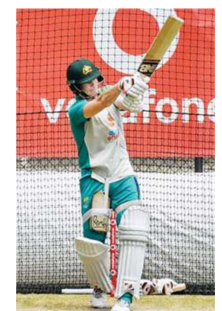
not present as much of a threat in the evening sessions as Australia's will. Australia's pace battalion have

India also won their only day-night Test but the Bangladesh pace attack at Eden Gardens last year probably did