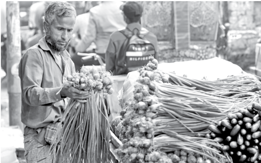
Rather than selling onions and the leaves separately, sellers are now lumping them together and selling new spring onions in bundles. This photo was taken New Eskaton Road recently.

Under the RHD, there are 22,096 km of national and regional highways and district roads, of which, 3,906km are national highways. Besides, it has 4,404 bridges, 14,814 culverts and 39 ferry terminals under its network, according to its 2018-19 annual report.