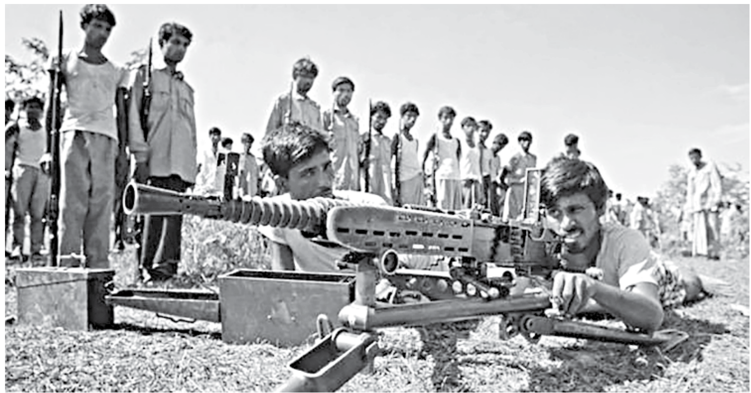
Members of the Mukti Bahini preparing for their next guerilla attack.