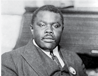
MARCUS GARVEY (1887-1940) Jamaican political activist, publisher and journalist.

The ends you serve that are selfish will take you no further than yourself but the ends you serve that are for all, in common, will take you into eternity.