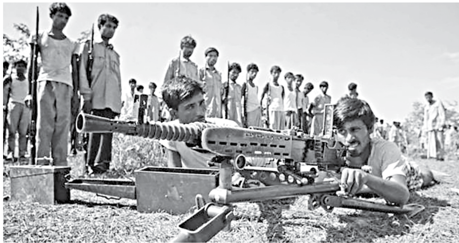
Members of the Mukti Bahini preparing for their next guerilla attack.