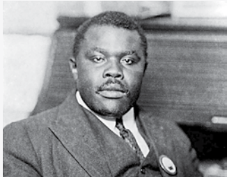
MARCUS GARVEY (1887-1940)

Jamaican political activist, publisher and journalist.