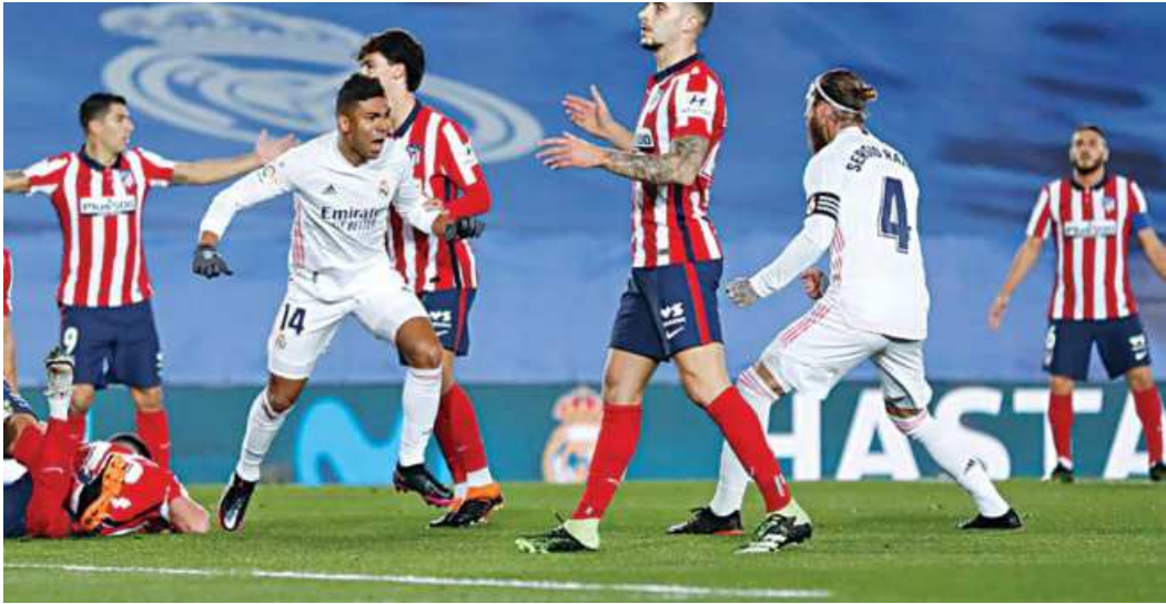
Real Madrid midfielder Casemiro (L) celebrates after scoring the opening goal against Atletico Madrid on Saturday.