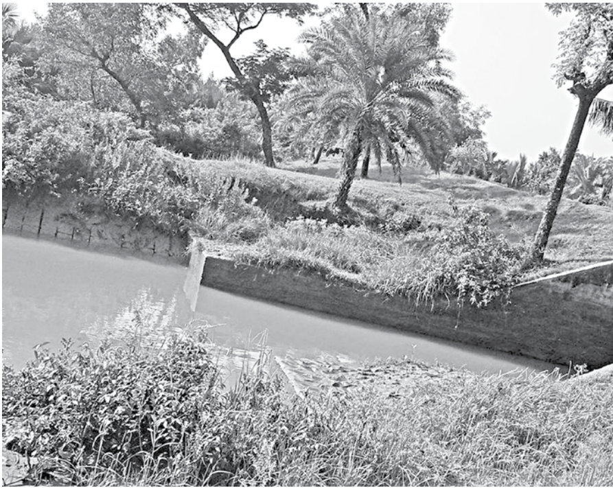
Farmers in Pakhimara area of Patuakhali's Kalapara upazila face uncertainty over Boro and seasonal vegetable cultivation as no dam is built on the canal to prevent saltwater intrusion towards fields.

Police said Rani was sowing some gourd sapling beside the road in front of her house around 8:00am when their neighbours Halim and his wife Puspa protested it, triggering an altercation between them.