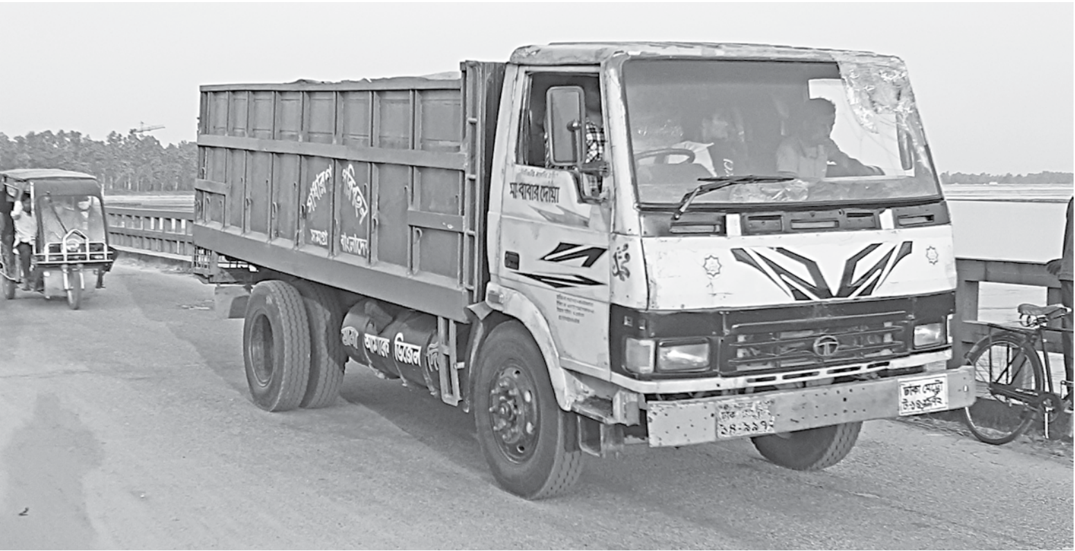
Defying the restriction, stone-laden trucks are seen plying freely over the Teesta Barrage, posing serious threat to the largest irrigation project of the country. The photo was taken from Dowani area in Lalmonirhat's Hatibandha upazila a few days ago.

To increase the production, the farmers can use organic fertiliser in their betel nut orchards, he said.