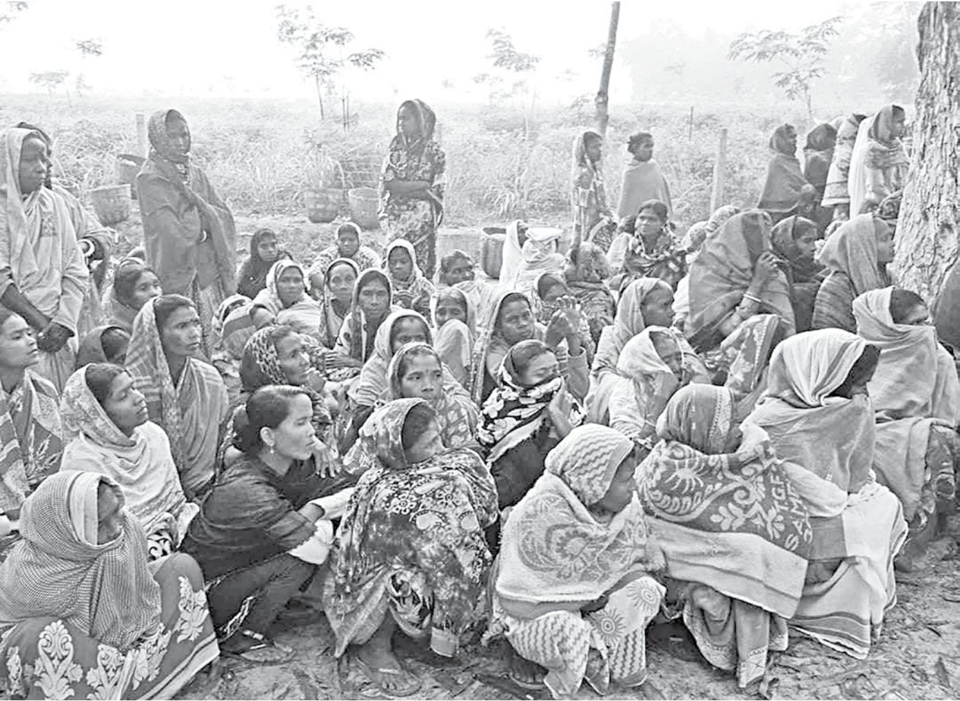
A section of impoverished tea workers at Sreebari Tea Garden in Chunarughat upazila of Habiganj.

Unless the criminals are brought to book, a clash might erupt over the irregularities and the president of the