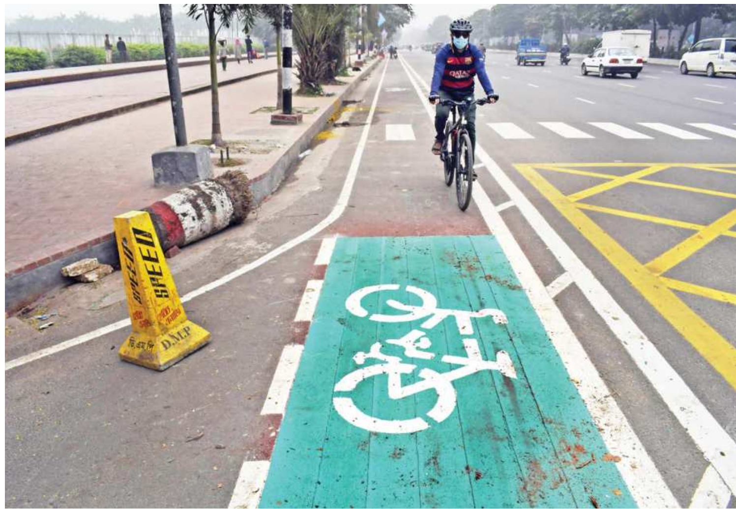
A cyclist making use of the newly painted cycling lane on one of the capital's biggest and most iconic streets, Manik Mia Avenue. Dhaka South City Corporation has been making separate lanes for the safety of cyclists. The photo was taken yesterday morning.