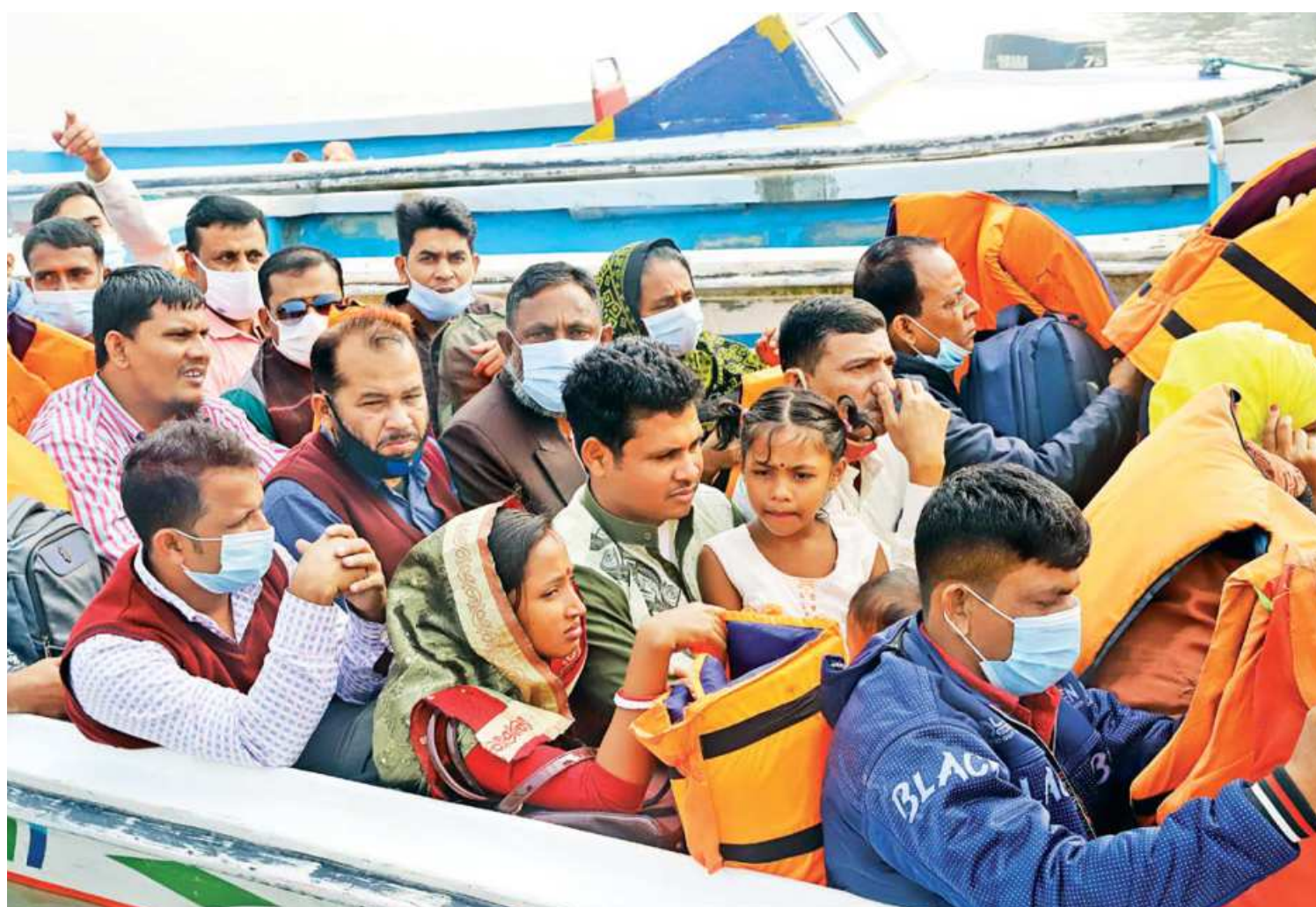
Passengers of a speedboat in Mawa sitting in close proximity, with many not wearing masks and some wearing the face coverings improperly. The lack of adherence to health guidelines among the general public amid fears of a second Covid-19 wave has become a common sight. The photo was taken on Tuesday.