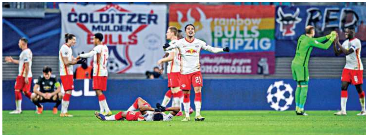
Leipzig players congratulate each other following their 3-2 win over Manchester United, a result which saw the Germans qualify for the knockout phase while consigning the Red Devils to a group-stage elimination for the first time in five years.