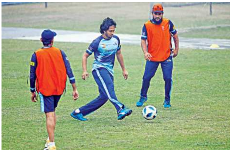
Gemcon Khulna's star player Shakib Al Hasan plays football with his teammates during training in Mirpur yesterday. The all-rounder has been out of form since his return to cricket and will be hoping to come good today when they take on (bottom) Mushfiqur Rahim's Beximco Dhaka in their Bangabandhu T20 Cup fixture, which is scheduled to start at 12:30pm.

But Tuesday's high scoring encounter between Minister Rajshahi and Fortune Barishal changed the scenario after both sides displayed an exciting brand of cricket.