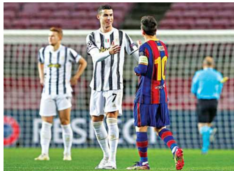
Juventus talisman Cristiano Ronaldo shakes hands with Barcelona superstar Lionel Messi prior to the kick-off of their Champions League fixture at Camp Nou on Tuesday.

United only needed a point from their final Group H game to advance to the knockout stage but