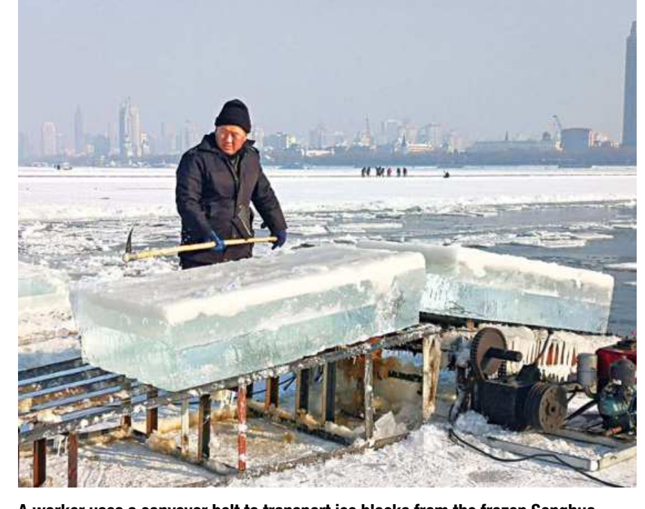
A worker uses a conveyor belt to transport ice blocks from the frozen Songhua river in Harbin in China's northeastern Heilongjiang province yesterday, as ice is collected for the Second Harbin Ice Harvest Festival.

German Chancellor Angela Merkel is urging regions to take much more drastic action to curb the spread, after state leaders agreed measures that would see comparatively modest social restrictions eased even further for the Christmas holidays.