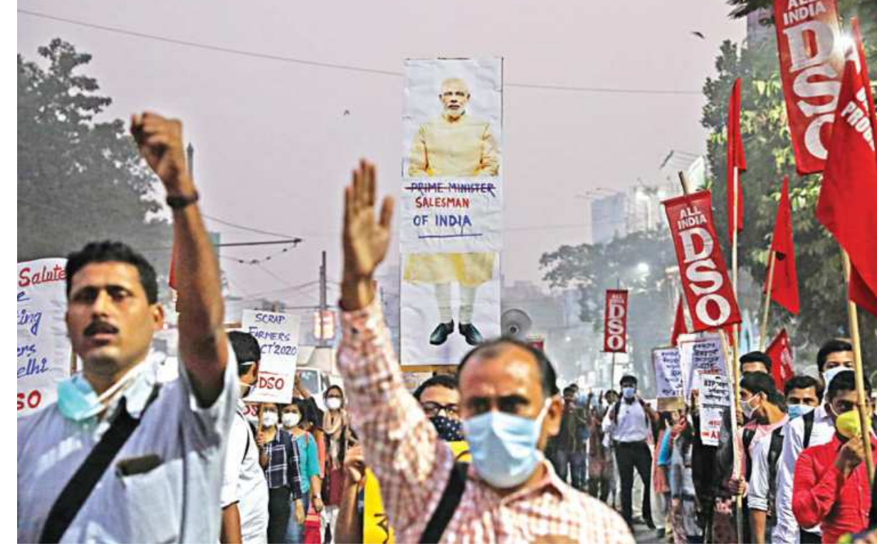
Activist from the All India Democratic Students Organisation (AIDSO) shout slogans during a protest march against the newly passed farm bills, in Kolkata, yesterday.

Meanwhile, the FDA issued a briefing document Tuesday saying the Pfizer-BioNTech vaccine is safe and effective, raising expectations the regulator is poised to grant emergency approval. It added that the vaccine worked uniformly across age groups, genders, and racial groups, as well as people with underlying conditions who are at high risk.