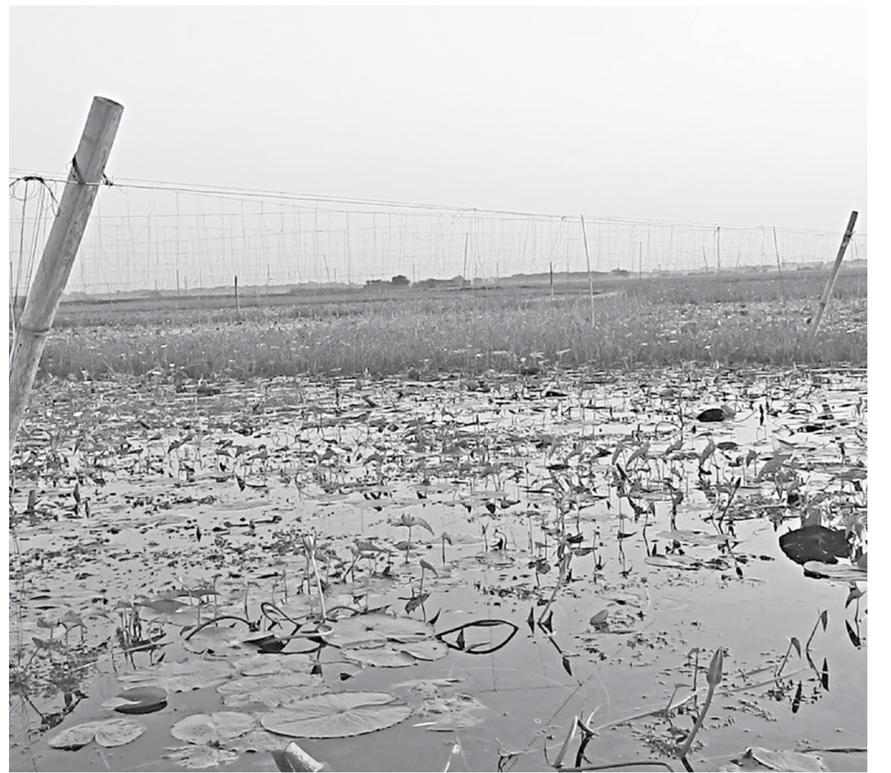
Poachers set nets in the Pateshri Beel of Narail's Kalia upazila to trap birds.