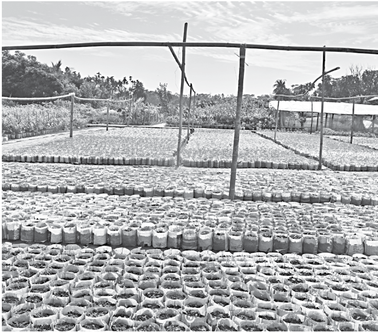
A flower nursery, in Alonkarkathi village of Pirojpur's Nesarabad upazila, wears a deserted look without buyers. The photo was taken recently.