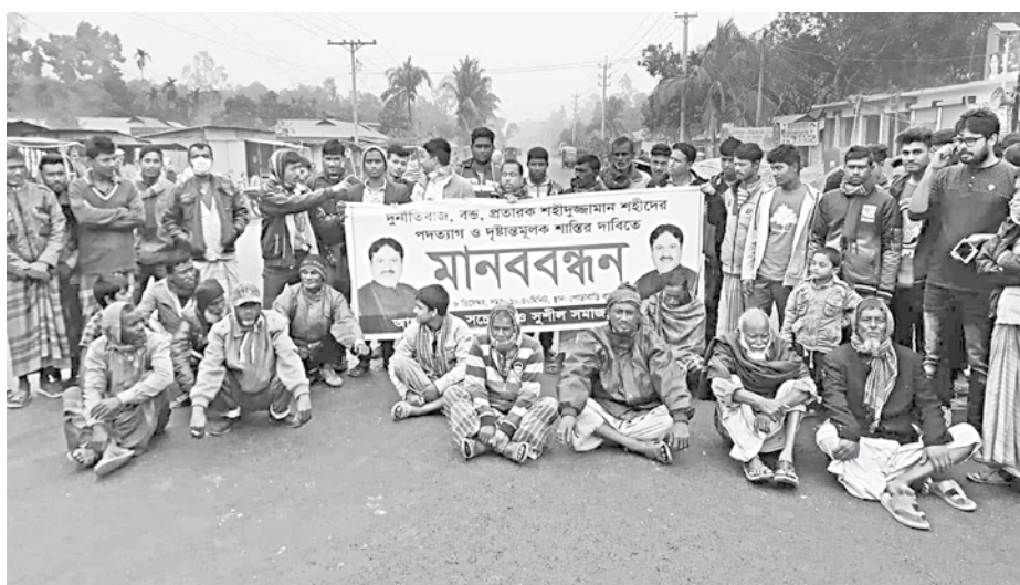
Local people form a human chain and blocked the Tangail-Jamalpur highway in Porabari Bus Stand area for an hour yesterday, protesting the corruption of Ghatail municipality Mayor Shahiduzzaman Khan.