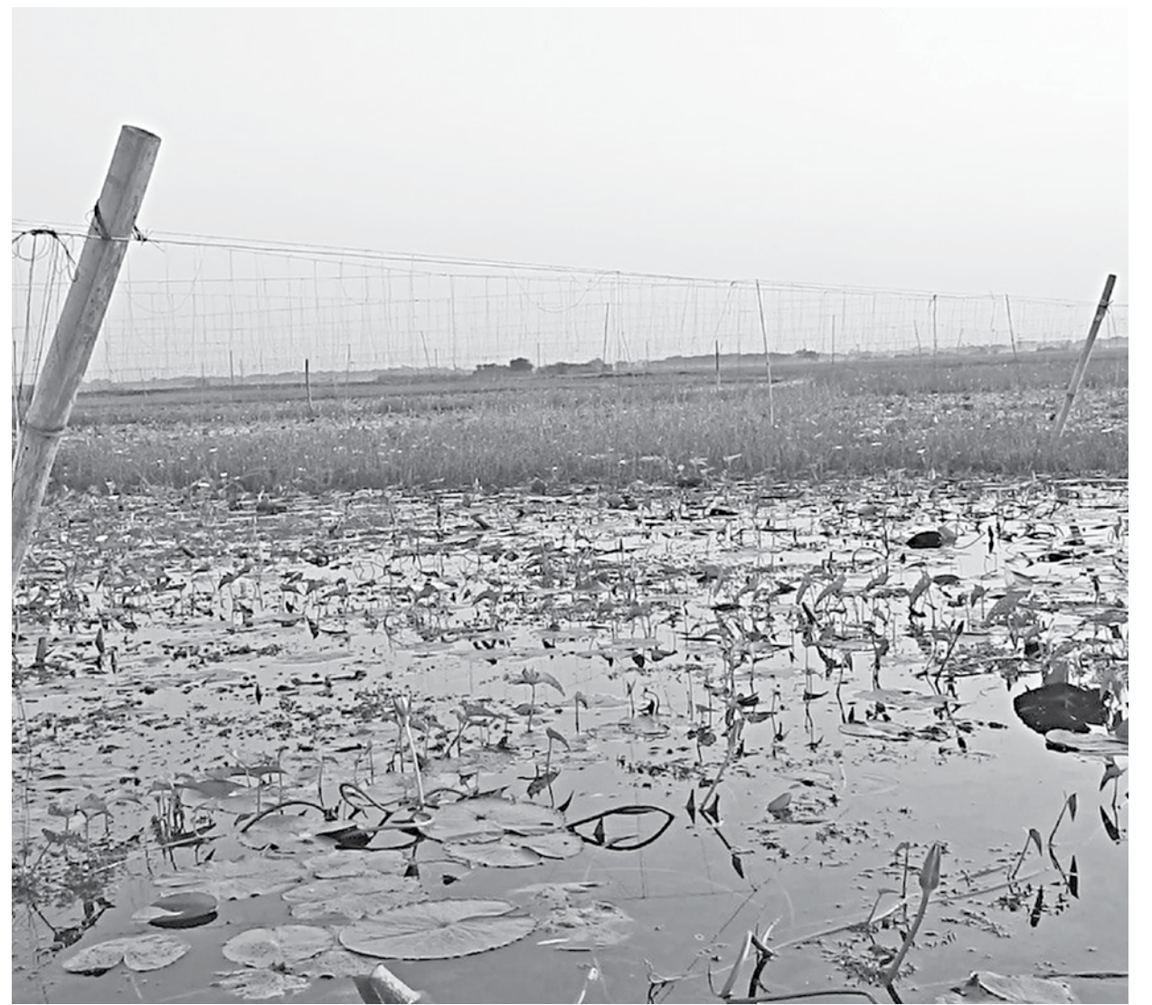
Poachers set nets in the Pateshri Beel of Narail's Kalia upazila to trap birds.